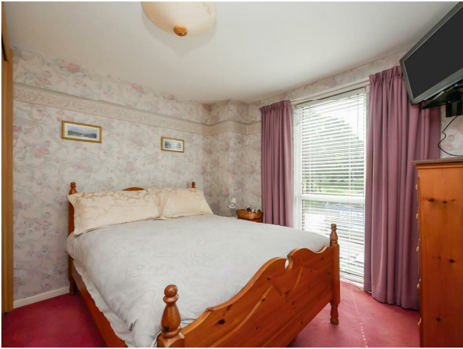
Double bedroom with dual aspect windows