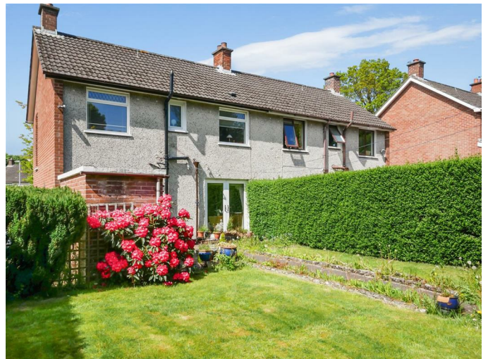
Enclosed rear garden with laid lawns bordered by mature hedging to the side and rear. Access to brick outhouse, housing oil condensing boiler.