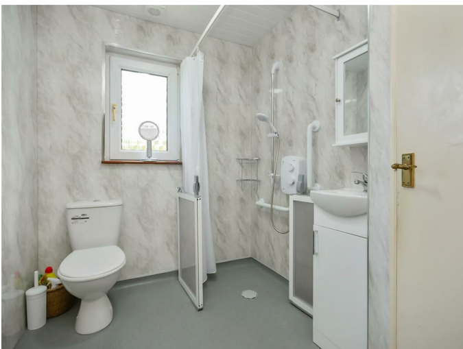
White shower suite comprising of low flush w.c, wash hand basin with vanity and walk in shower. Marble effect upvc panelled walls and anti-slip polyurethane flooring. Access to hot press.