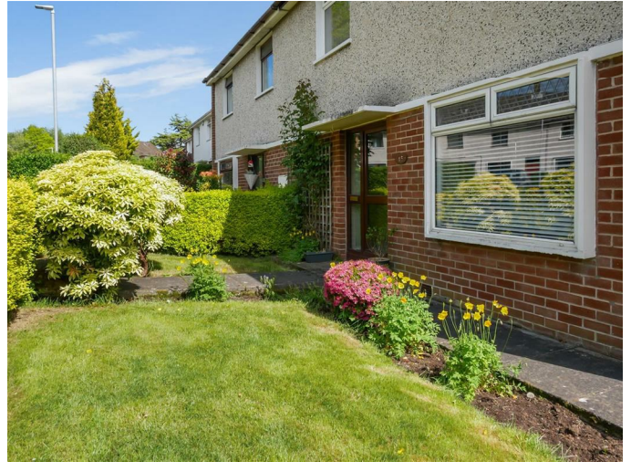
Beautifully maintained gardens to the front and side with laid lawns bordered by mature hedging.