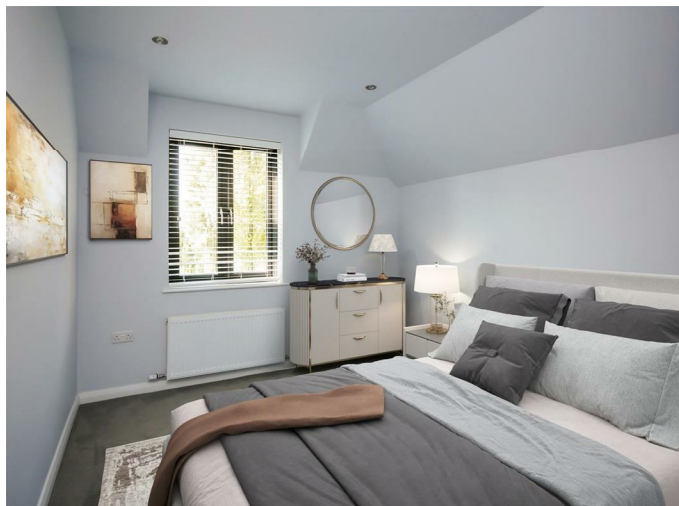
Bedroom One 11'5 x 10'1 (3.48m x 3.07m)