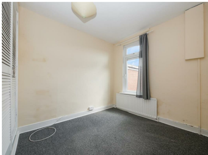
Bedroom 2 10'7 x 8'2 (3.23m x 2.49m)