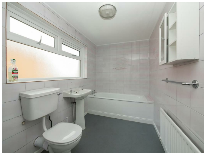
Bathroom 11'7 x 5'9 (3.53m x 1.75m)

White suite comprising panelled bath, low flush w/c, pedestal wash hand basin, corner shower cubicle with thermostatically controlled shower, fully tiled walls.