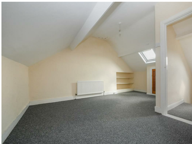
Bedroom 3 15'5 x 11'8 (4.70m x 3.56m)

At widest points, Roof window, eaves storage.