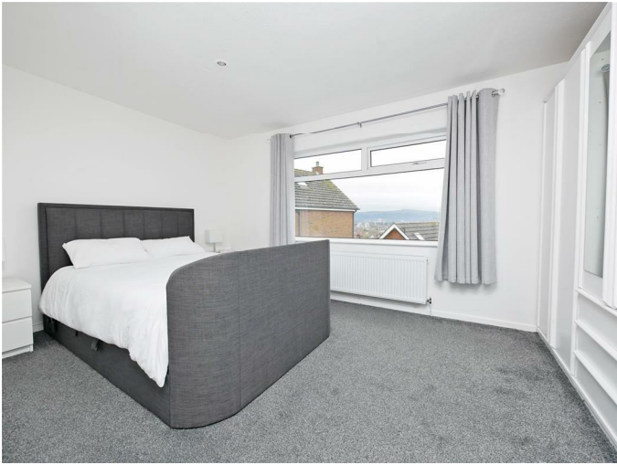
Bedroom 1 15'4 x 10'2 (4.67m x 3.10m)

Fantastic views to the rear over Belfast and beyond.