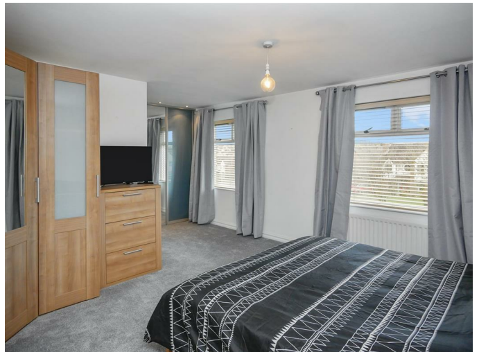
Bedroom One 18'2 x 14'1 (5.54m x 4.29m)