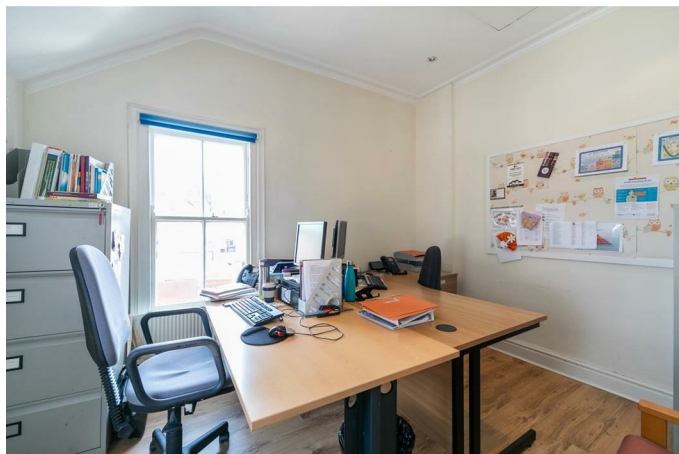
STORAGE 8'6" x 3'11" (2.6 x 1.2)