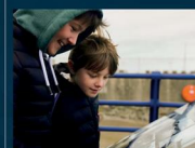
The Wheelers A local family

We moved with the family from London. I have an easy commute to Belfast for work and the best thing is I feel like I am on holiday every evening when I get home.