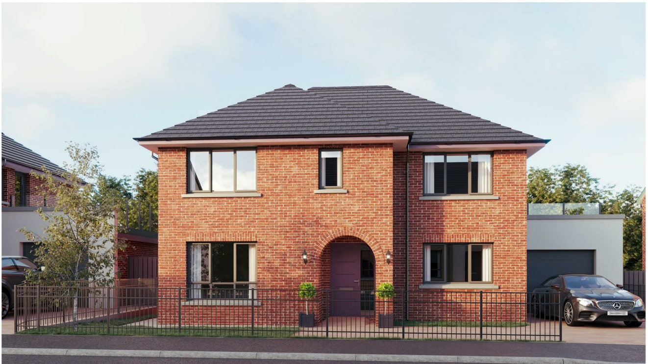
HOUSE TYPE 7

Offering easy access to National Trust sites, nature reserves, and leisurely strolls, living here makes every day feel like an adventure. Whether you're drawn to the tranquility of Barr's Bay for a refreshing swim or the vibrant ambience of Greyabbey Village for eclectic shopping and dining, you can embrace a lifestyle where every moment is framed by natural beauty and endless possibilities.