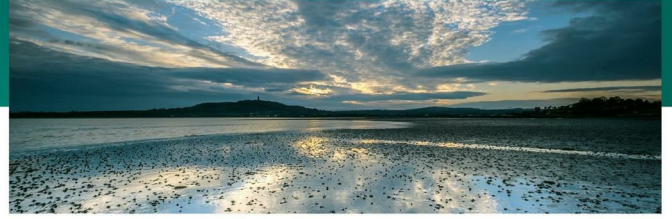
DETACHED AND SEMI-DETACHED SHORESIDE HOMES