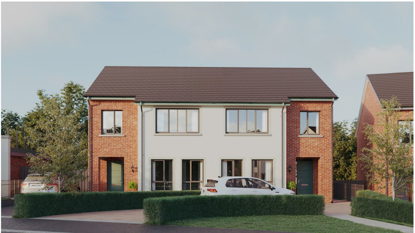
HOUSE TYPE 4

Offering easy access to National Trust sites, nature reserves, and leisurely strolls, living here makes every day feel like an adventure. Whether you're drawn to the tranquility of Barr's Bay for a refreshing swim or the vibrant ambience of Greyabbey Village for eclectic shopping and dining, you can embrace a lifestyle where every moment is framed by natural beauty and endless possibilities.