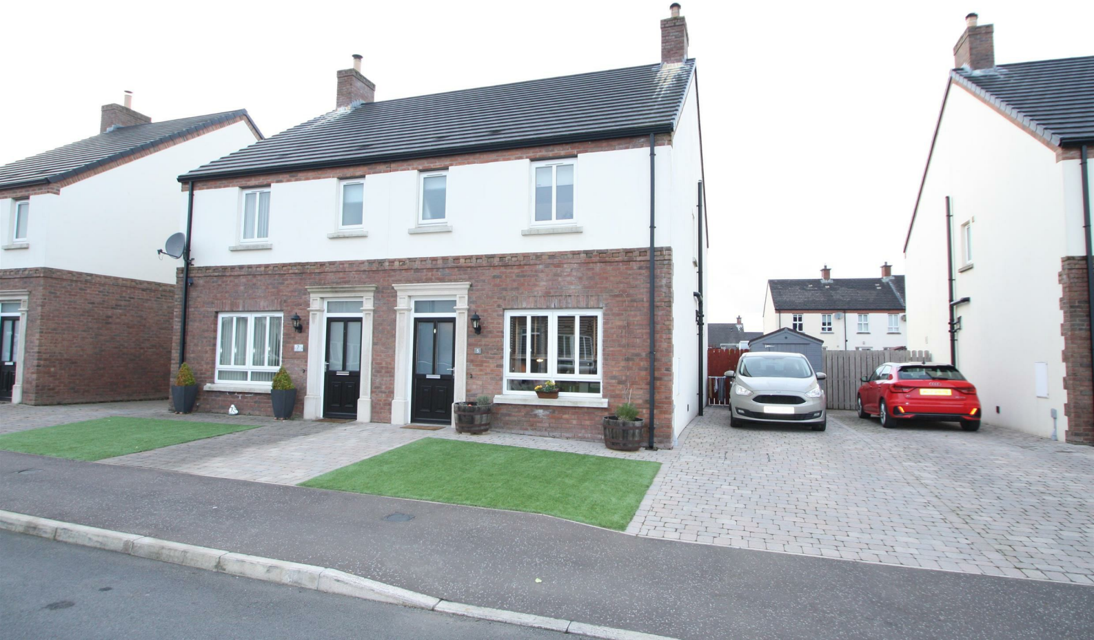
5 RIVERVIEW WALK, BALLYNAHINCH, DOWN, BT24 8FN