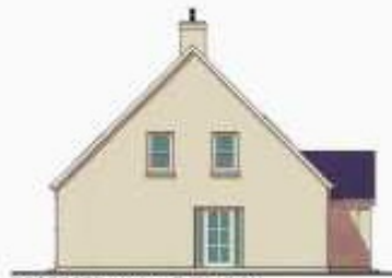
PROPOSED western ELEVATION