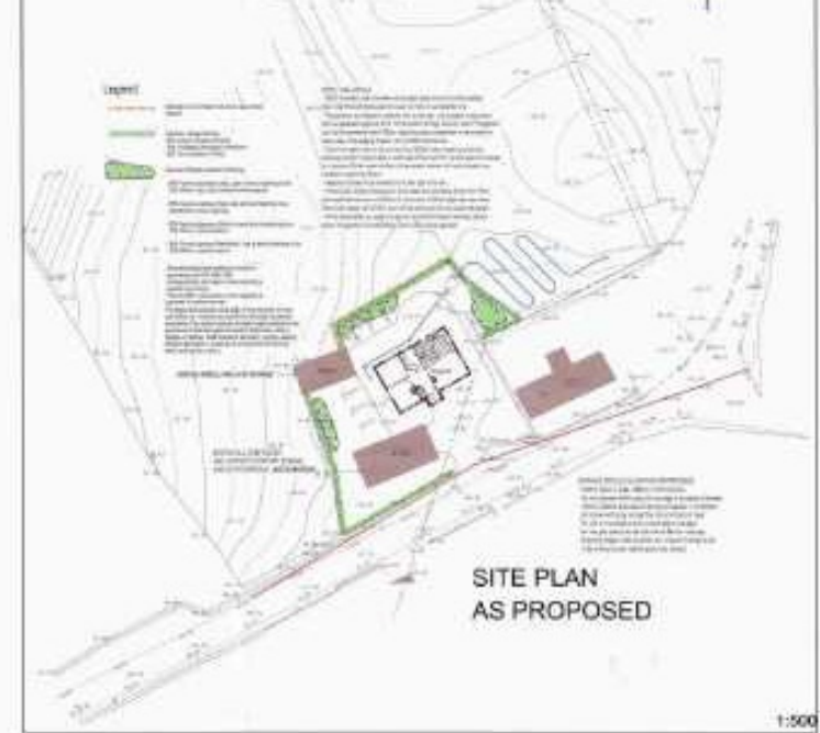
SITE PLAN AS PROPOSED