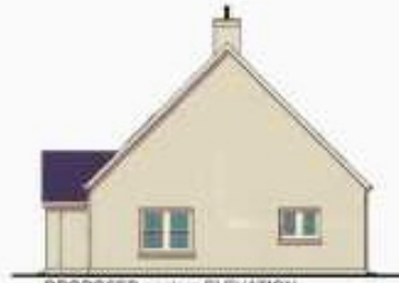
PROPOSED eastern ELEVATION