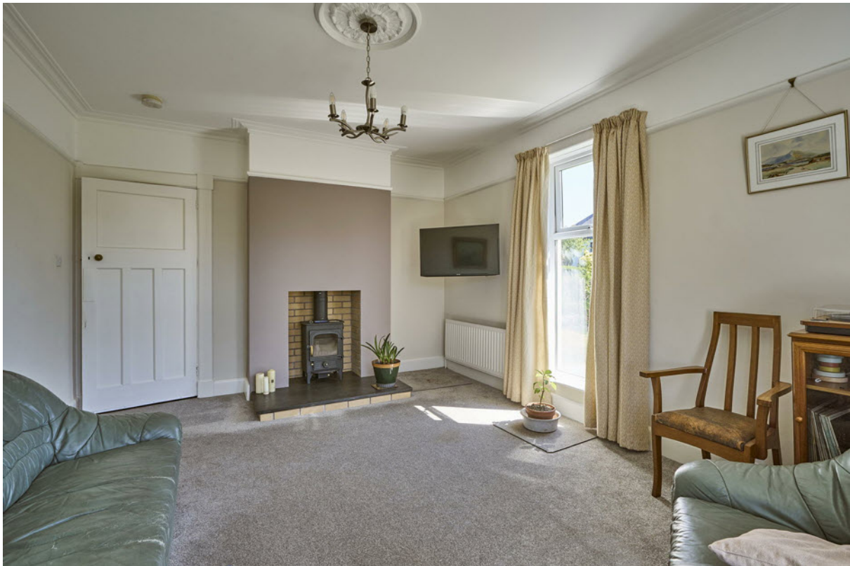
DINING ROOM: 13' 0" x 16' 0" (3.96m x 4.88m) Cornice ceiling, picture rail, floor to ceiling windows.