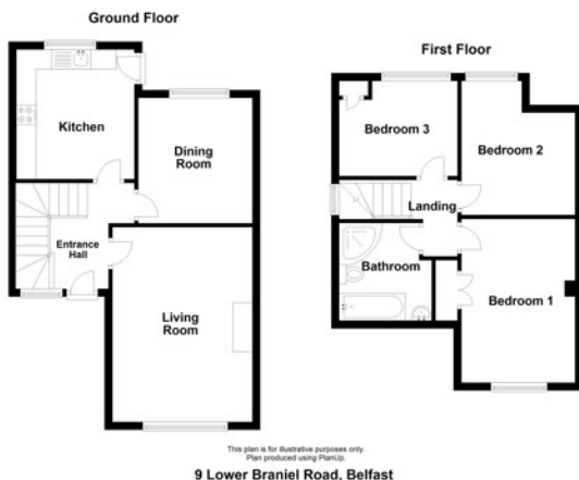
9 Lower Braniel Road, Belfast

Ballyhackamore - 028 90 65 0000 Lisburn Road - 028 90 66 3030 North Down - 028 90 42 4747 Lisburn - 028 92 66 1700