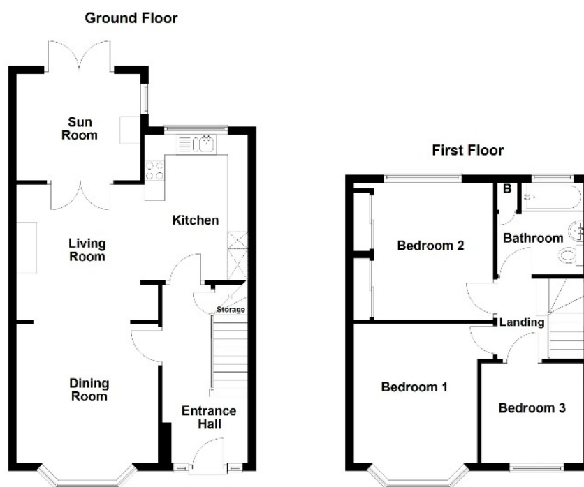
41 Glenview Gardens, Belfast

Off the Ballygowan or Knock Roads into Glen Road, then turn up Lower Braniel Road and Glenview Gardens is first right.