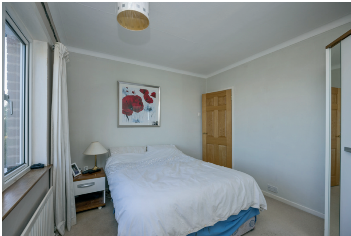
BEDROOM (3): 9' 7" x 9' 3" (2.92m x 2.83m) (Plus entrance area and into built-in robe) with mirror fronted sliding doors. Cornice ceiling.