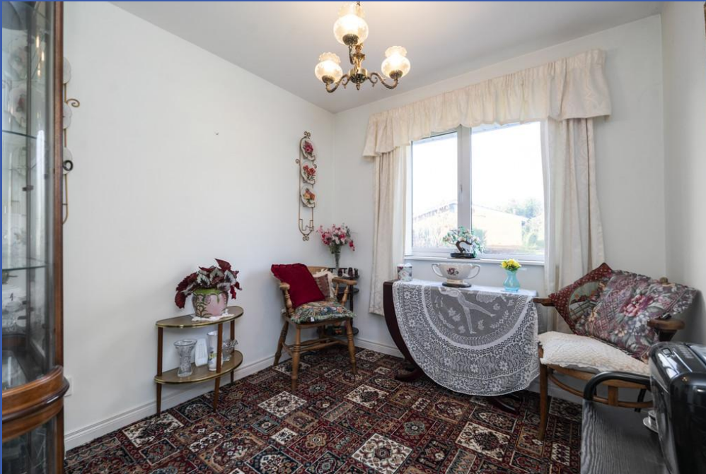
BEDROOM THREE 8' 3" x 8' 1" (2.54m x 2.47m)