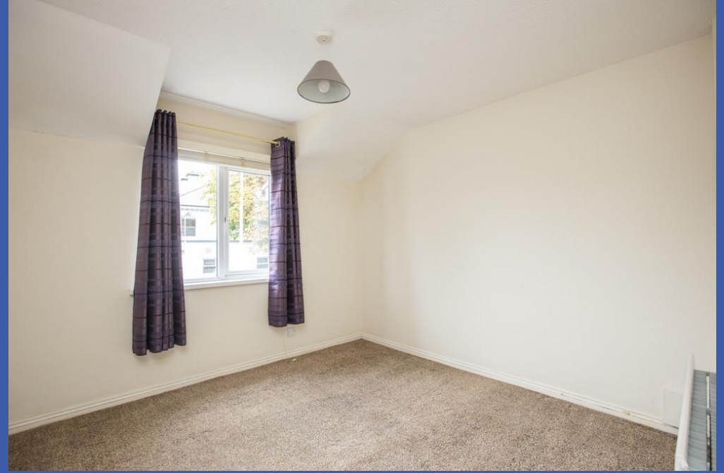
BEDROOM 1 10' 8" x 10' 0" (3.27m x 3.06m)