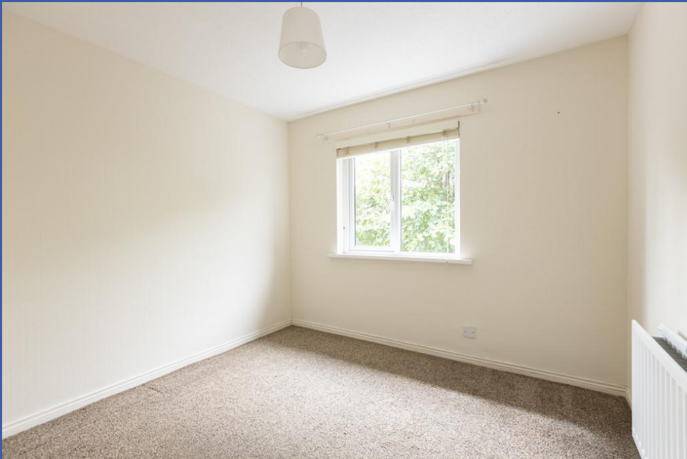
BEDROOM 2 9' 9" x 9' 1" (2.98m x 2.79m)