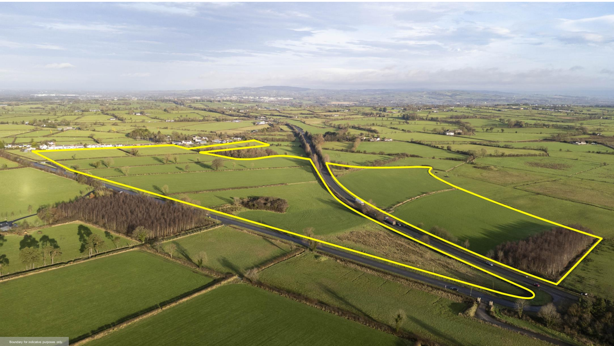
Boundary for indicative purposes only.