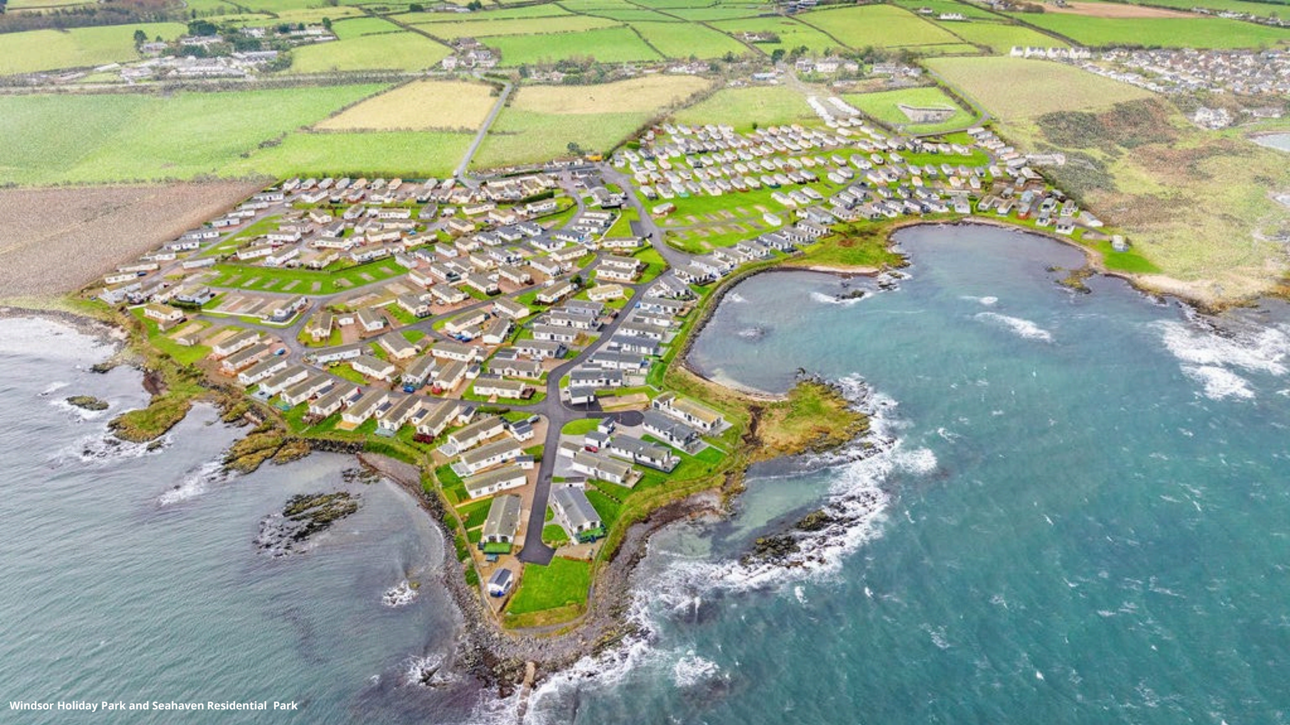
Windsor Holiday Park and Seahaven Residential Park