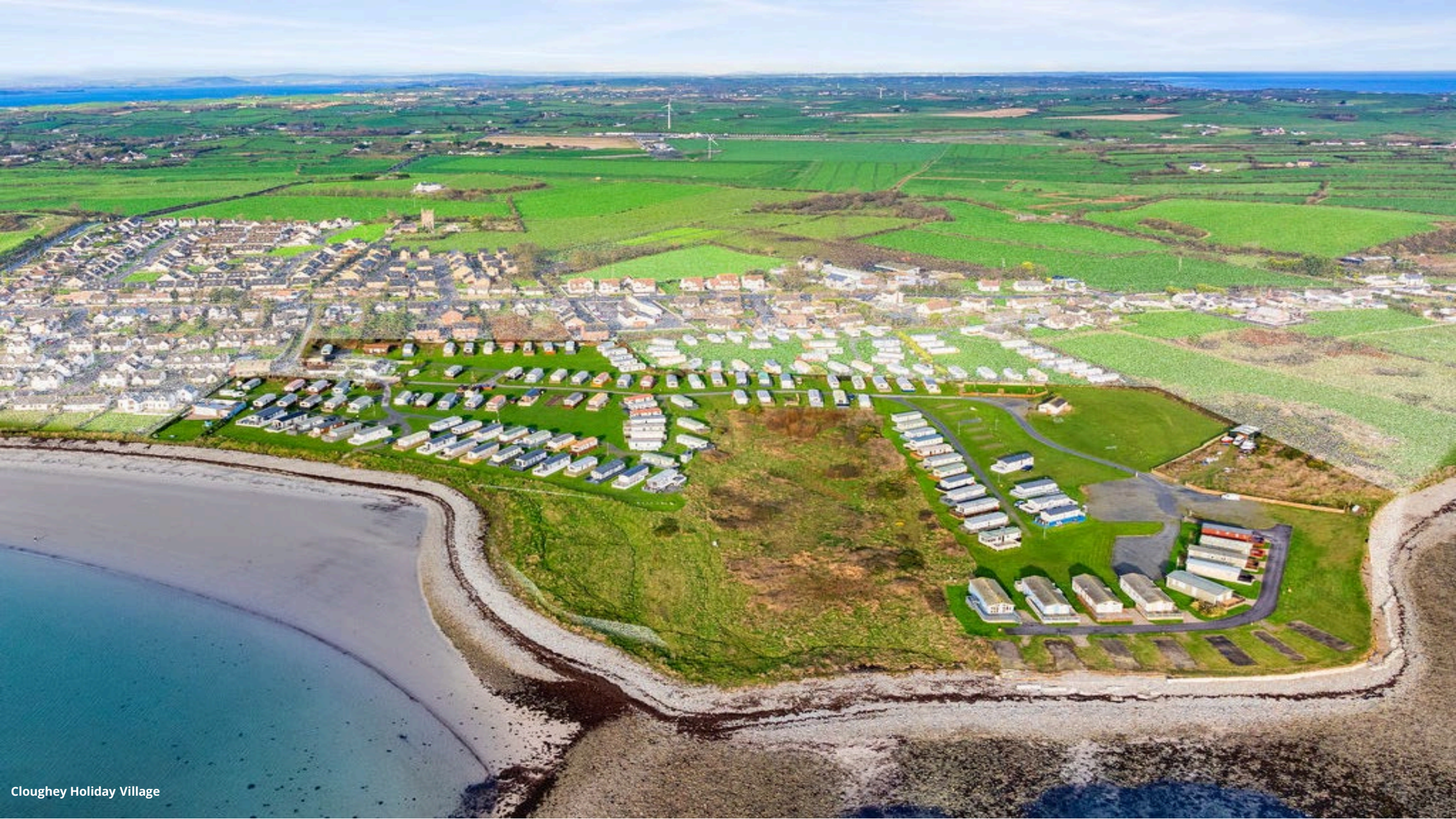
Cloughey Holiday Village