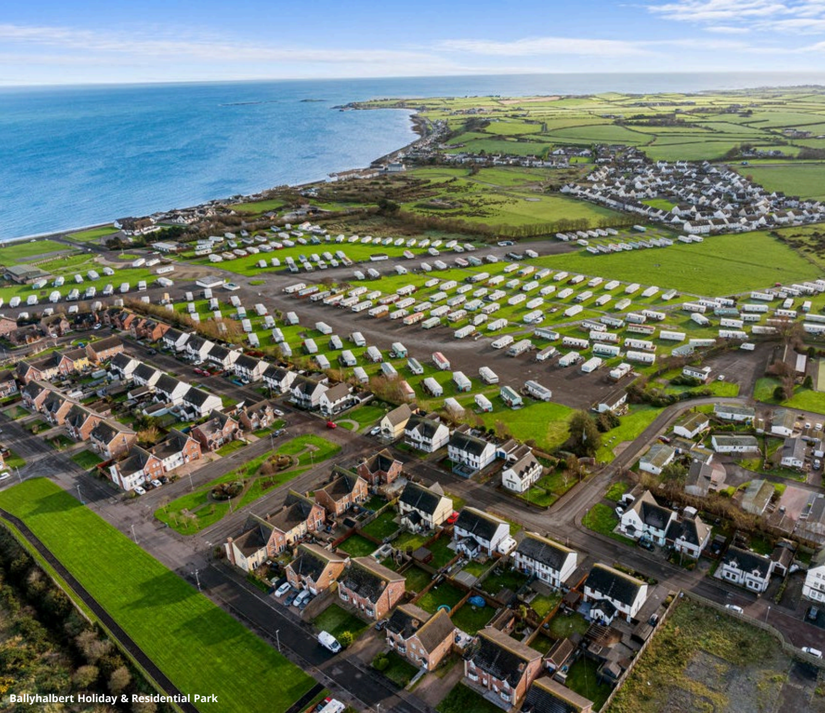
Ballyhalbert Holiday & Residential Park