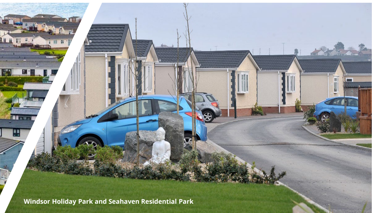
Windsor Holiday Park and Seahaven Residential Park