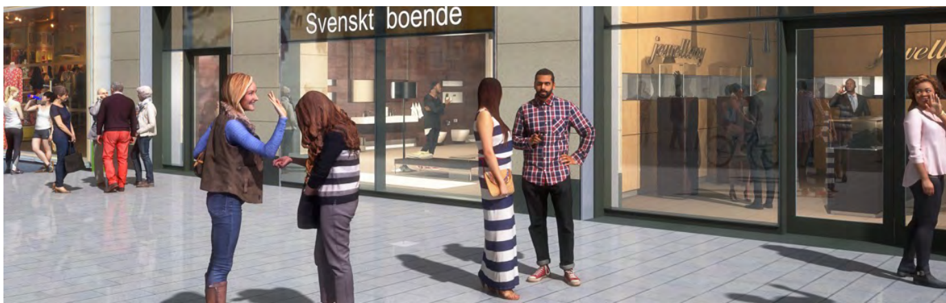
Arthur Street Frontage