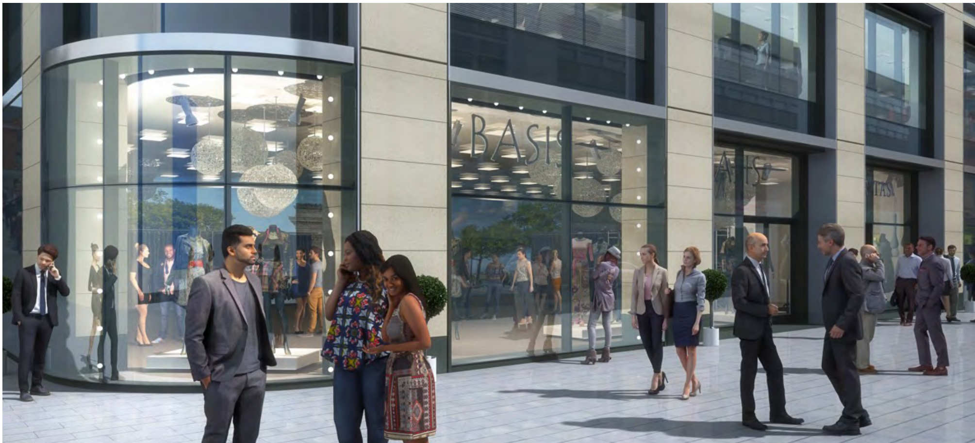
Chichester Street Frontage