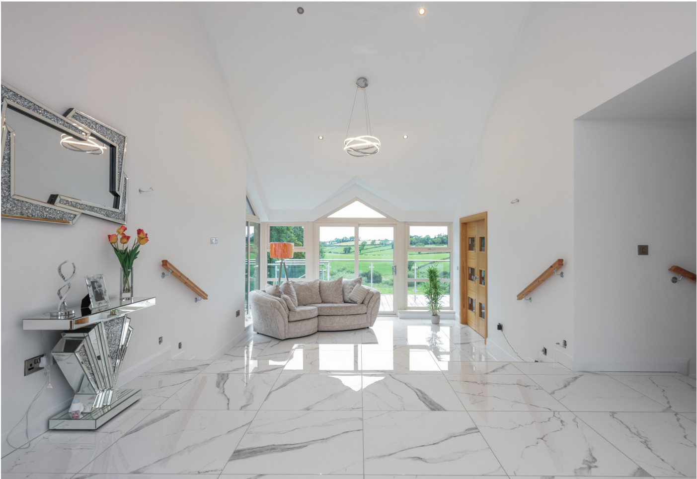
Caption for image.