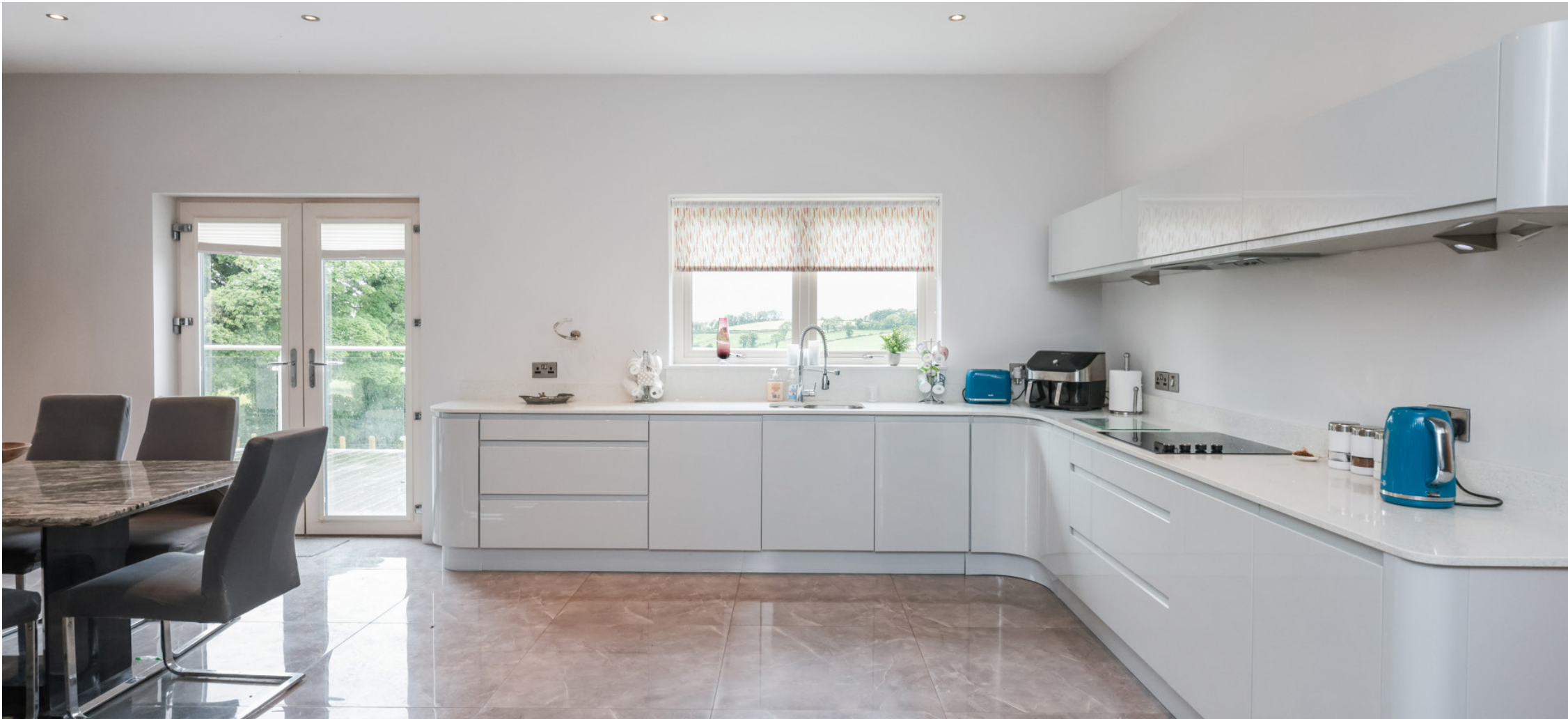
Magnificent kitchen with contemporary high gloss German cupboards