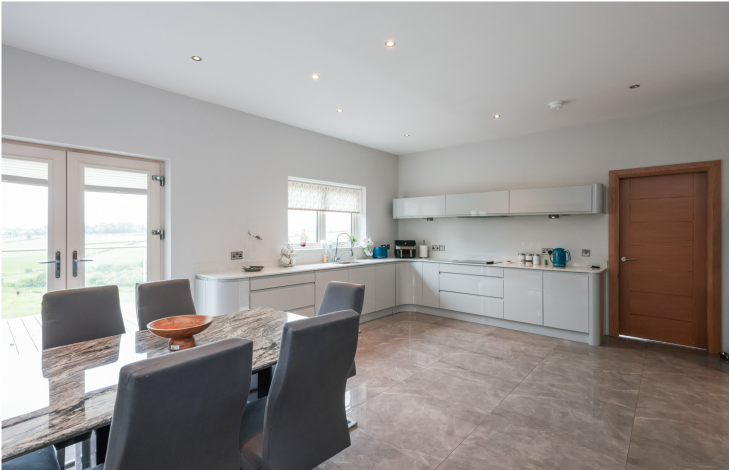
Dining area with double French doors to deck and garden