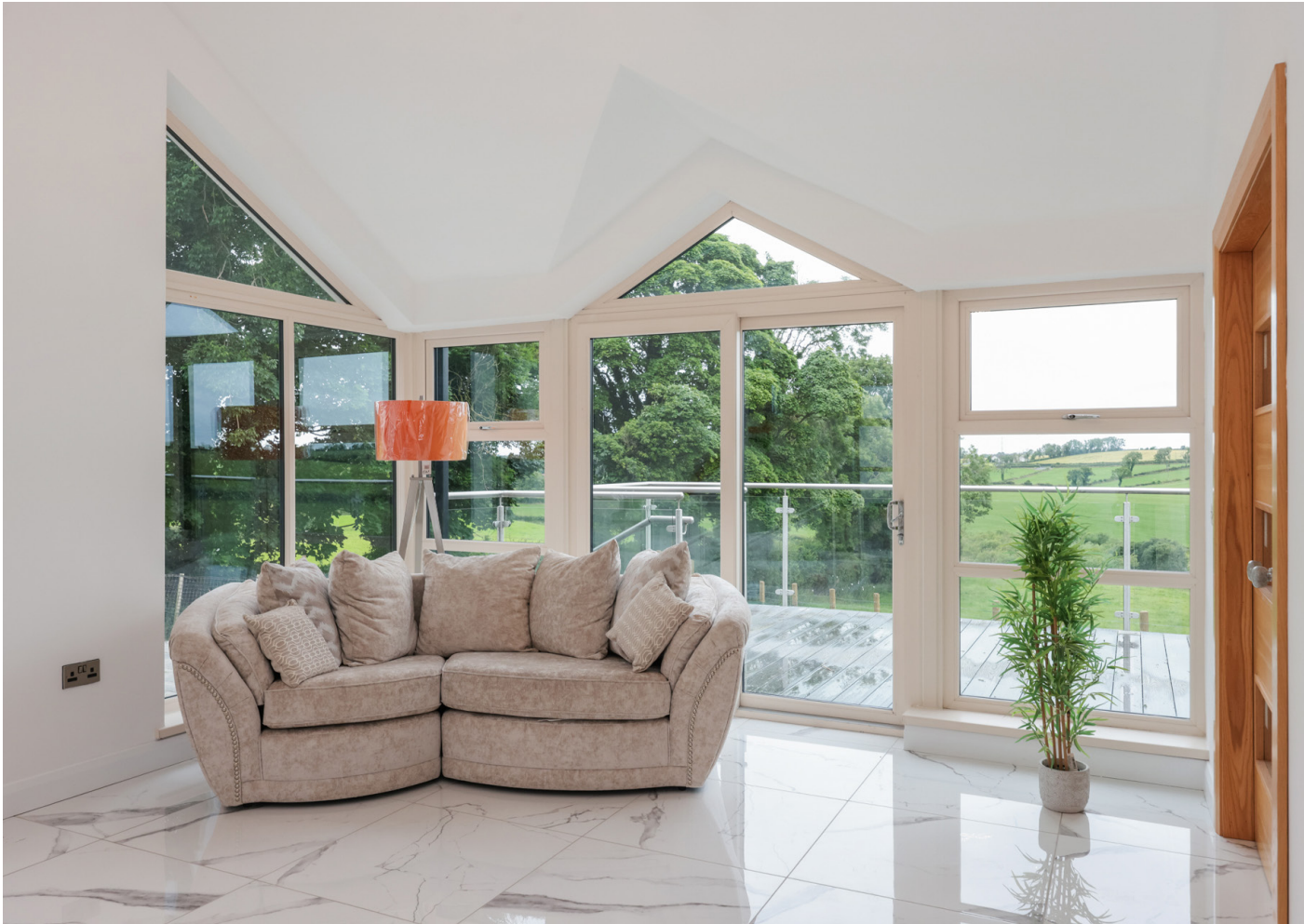
Caption for image.

Bright detached bungalow c. 2,227 square feet