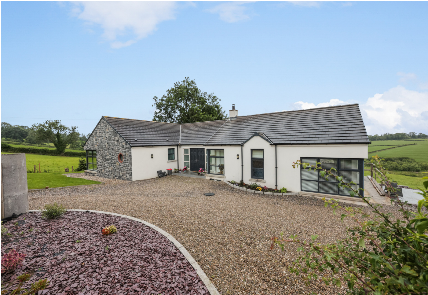
Caption for image.