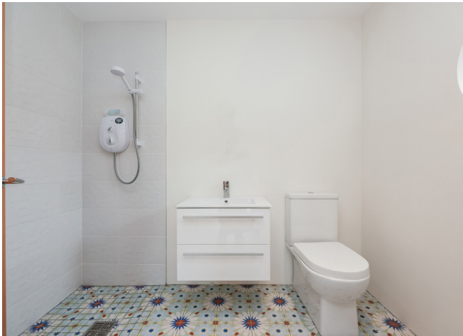
Bedroom 1 ensuite

Sheltered, recessed circular patio and barbecue area. Auto floodlights. uPVC oil tank.