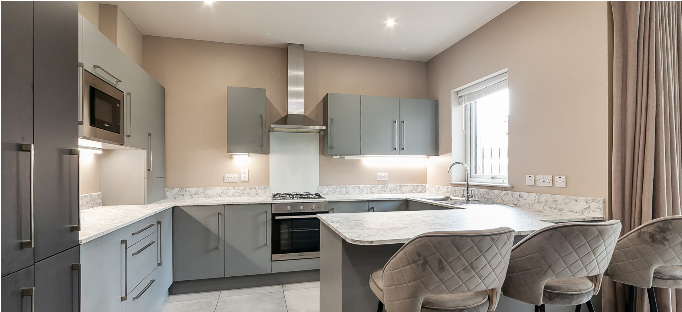
Luxury kitchen open to dining and sunroom