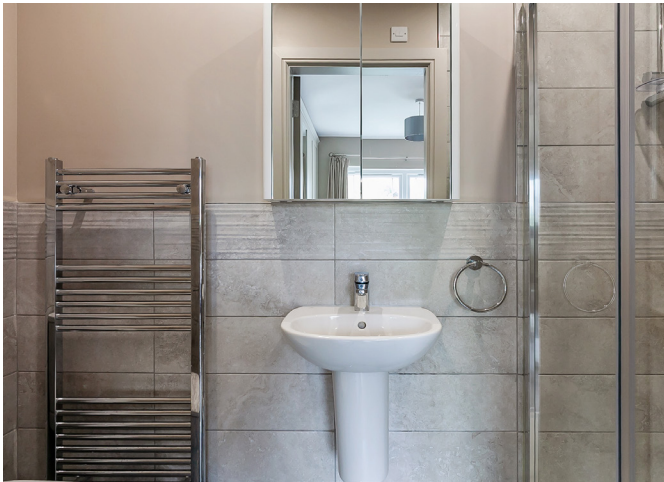
Ensuite shower room

Tarmac driveway with parking for two cars.