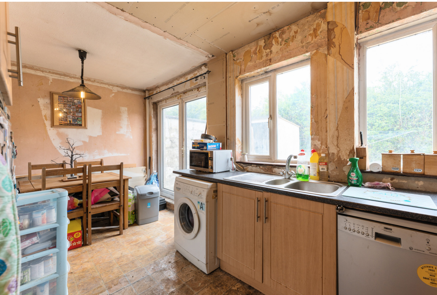
Kitchen and dining space with French doors to garden and outside