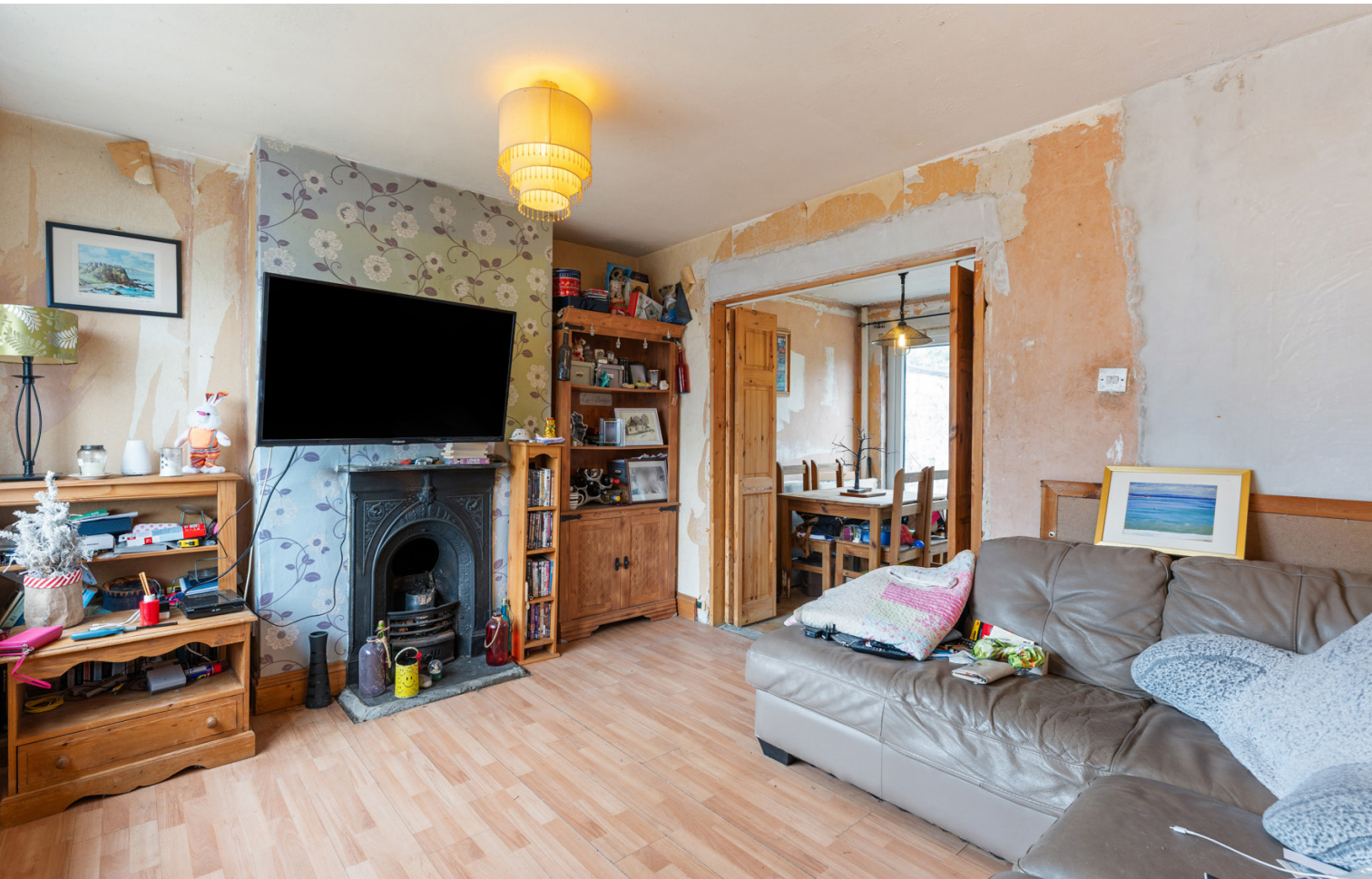
Living room with period style fireplace