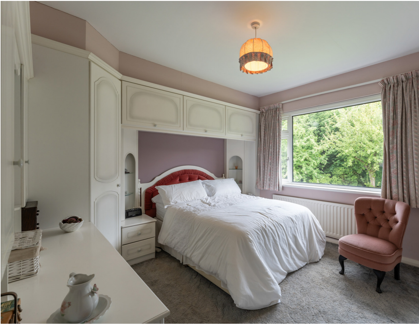
Bedroom (1) with built in furniture