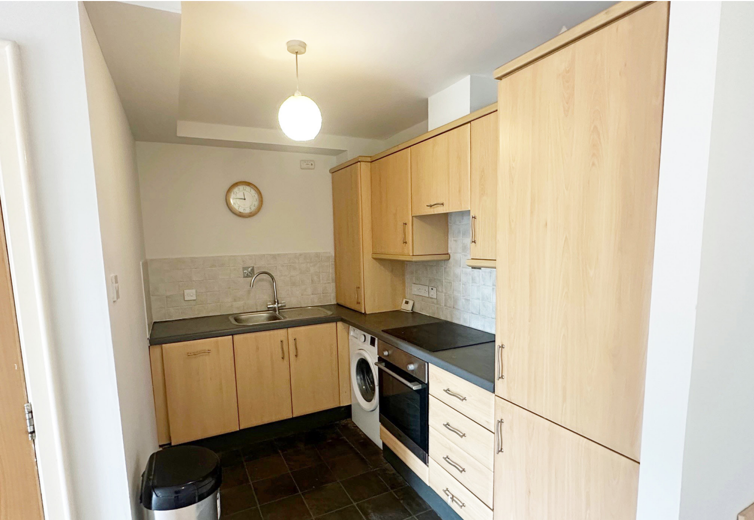
Kitchen with appliances

Vaulted ceiling, stairs and lift to all floors. Also car park access.