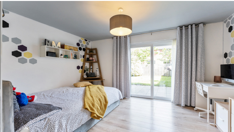
Bedroom 2/family room