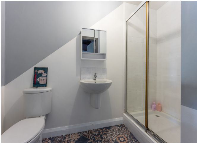
Ensuite shower room

Tarmac driveway with parking for three cars and flowerbeds. Steps to front door. Fence enclosed rear garden laid in lawns and paved patio area. Tap and light.