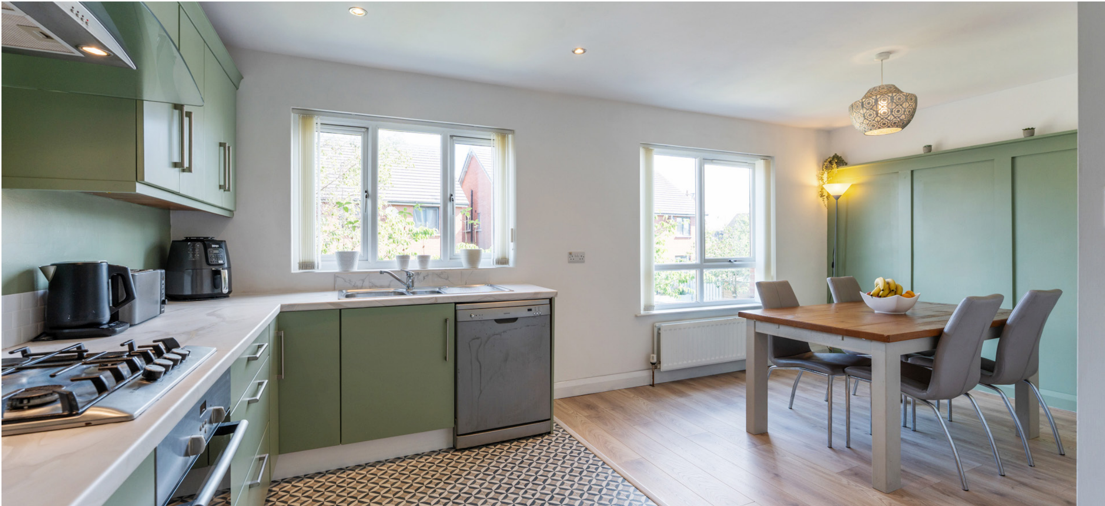
Kitchen open to dining room