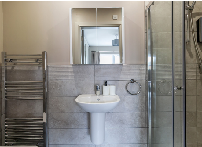
Ensuite shower room

Tarmac driveway with parking for two cars.