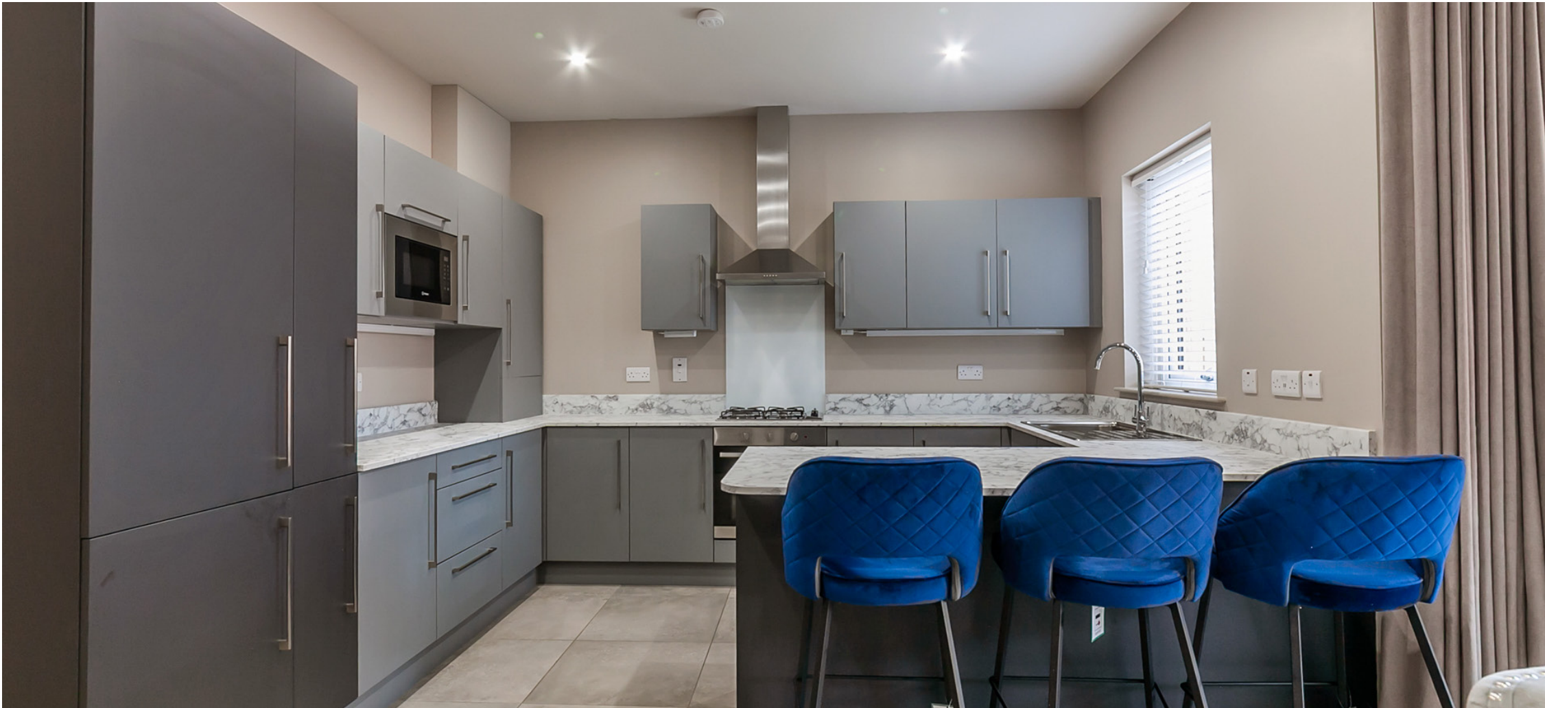
Luxury kitchen open to dining and sunroom