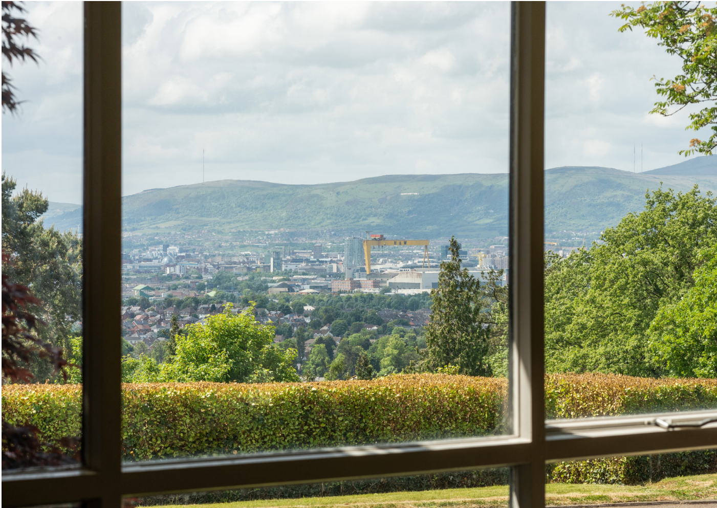
Views from the drawing room