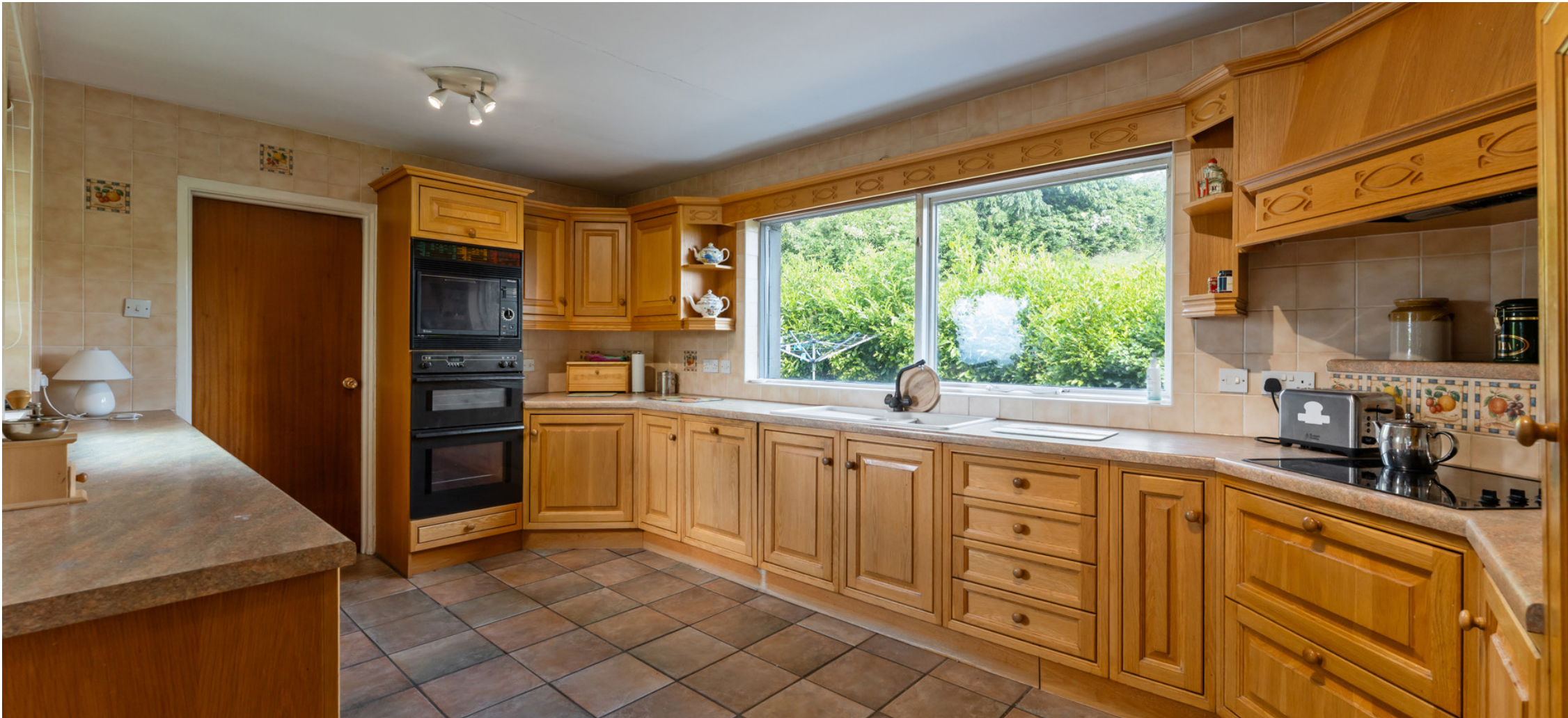
Solid oak kitchen