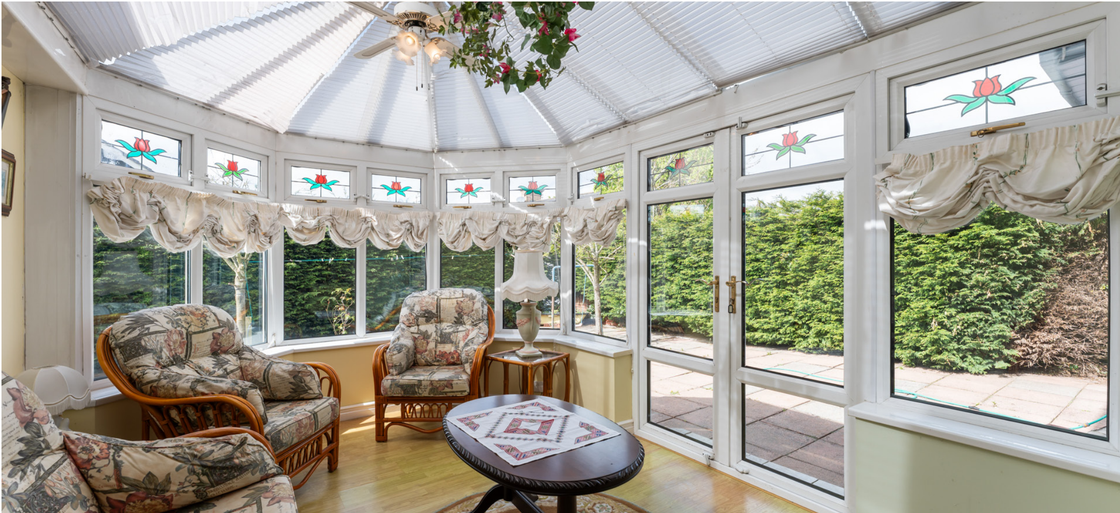
Conservatory leading to terrace