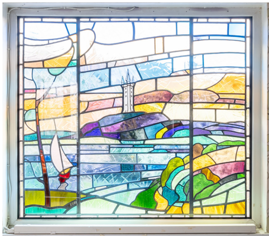
Double glazed window with Scrabo Tower scene