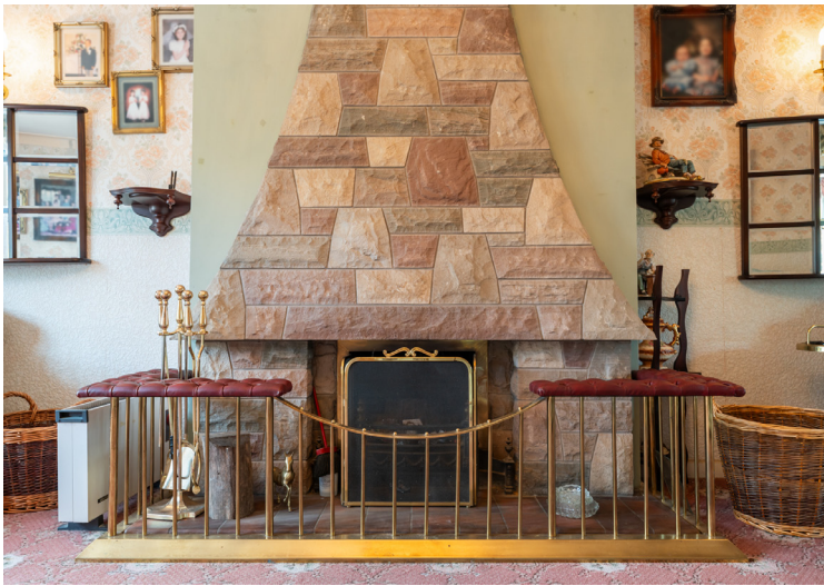
Scrabo stone fireplace