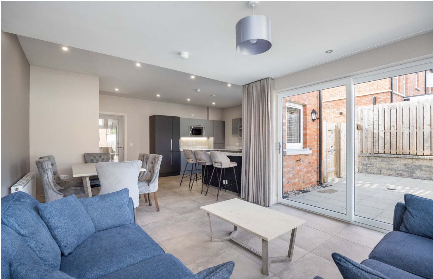
Sitting room off the kitchen