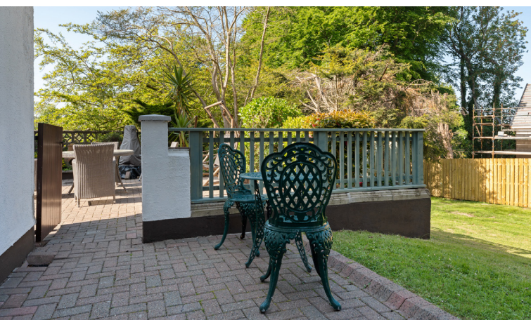
Patio area outside the conservatory