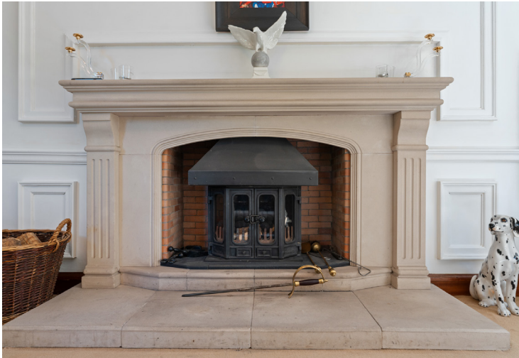
Feature drawing room fireplace