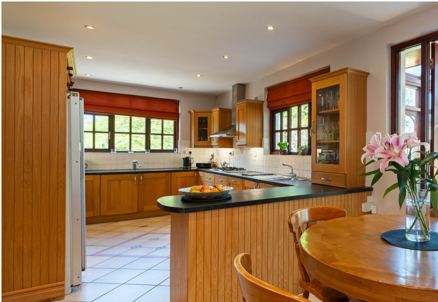
Solid oak kitchen