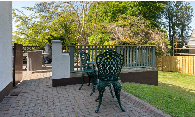
Patio area outside the conservatory