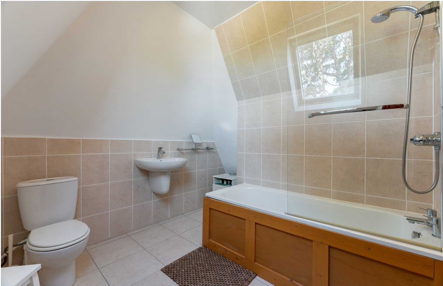
Bedroom 5 ensuite