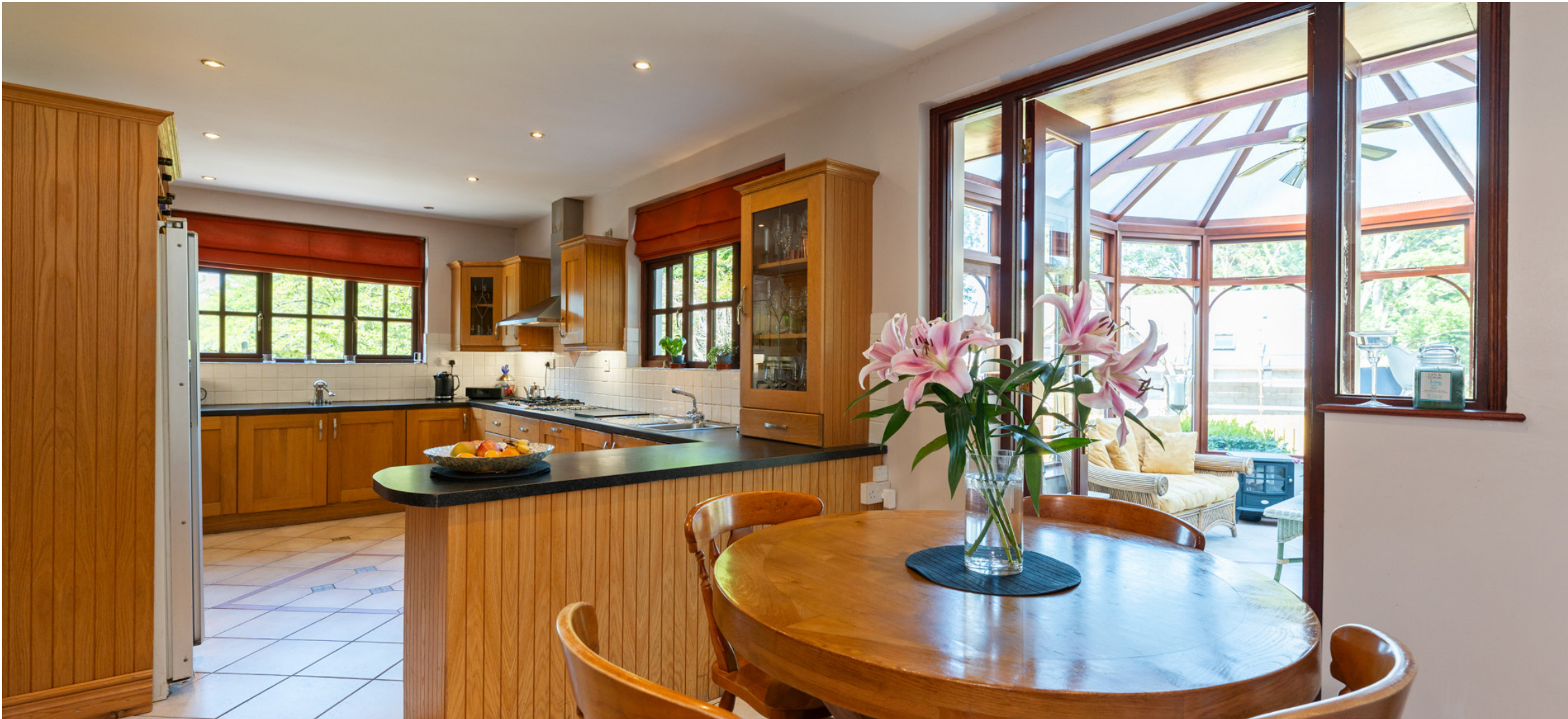
Solid oak kitchen