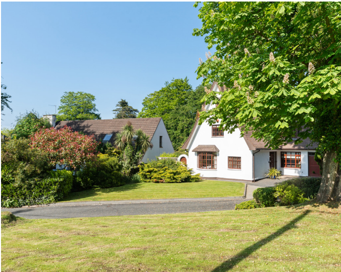
Front lawns and driveway