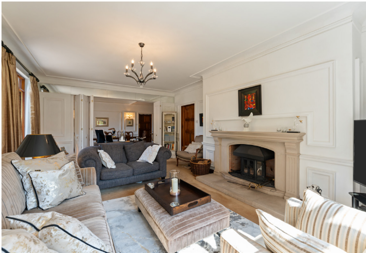
Feature drawing room fireplace