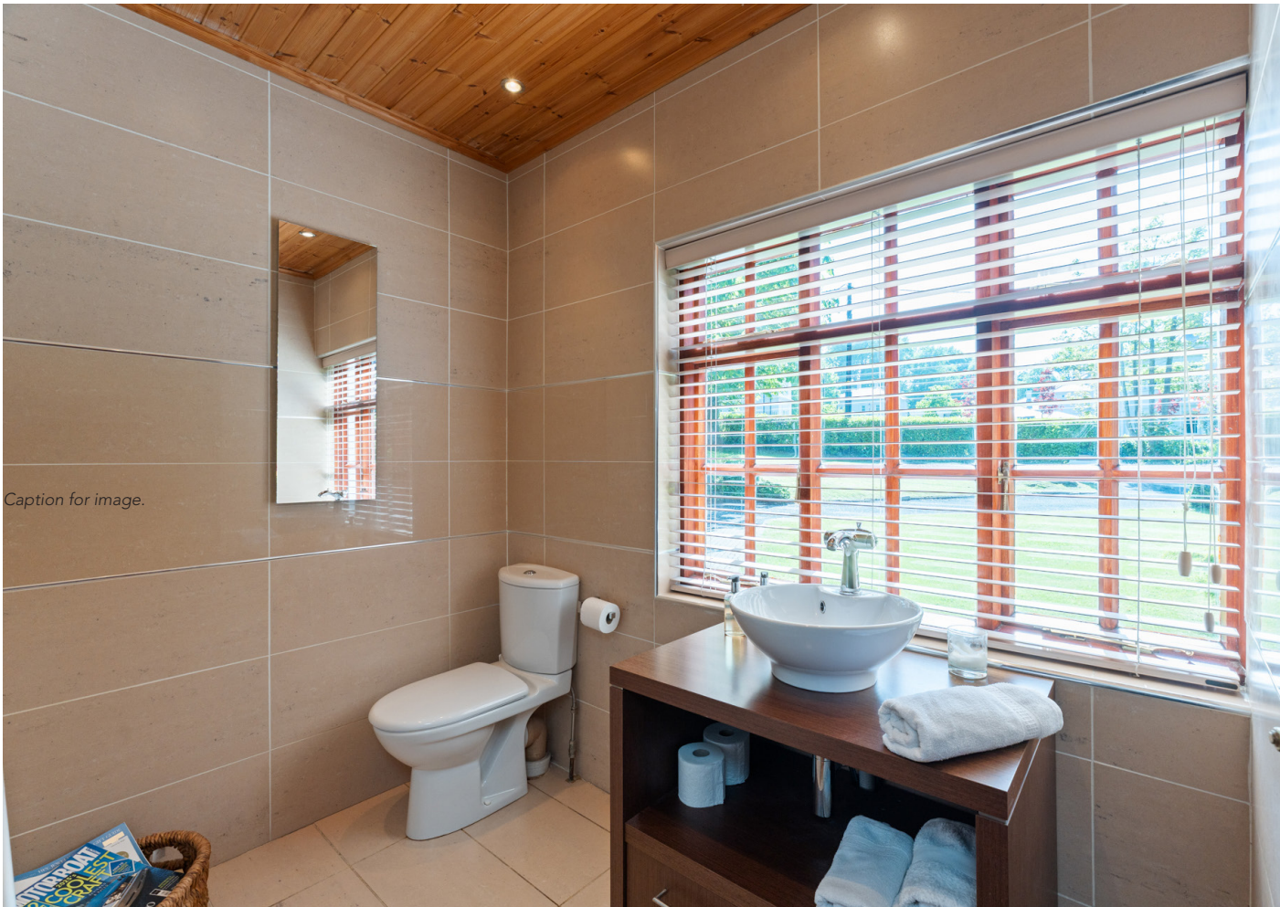
Caption for image.