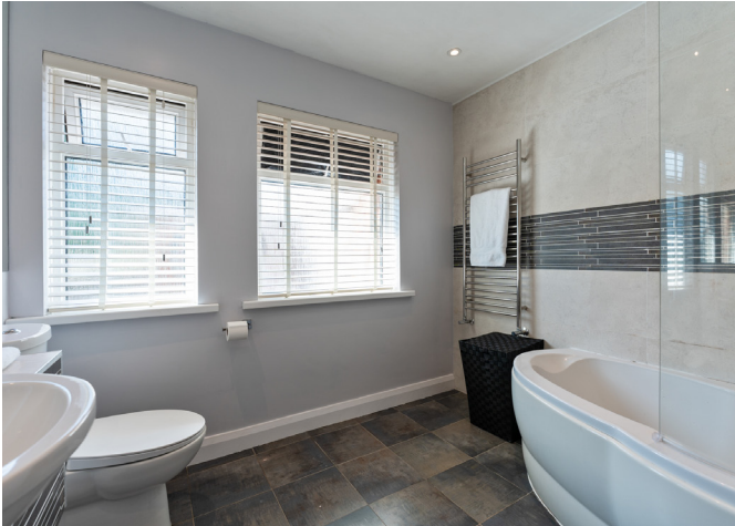
Bathroom 2 with bath and shower