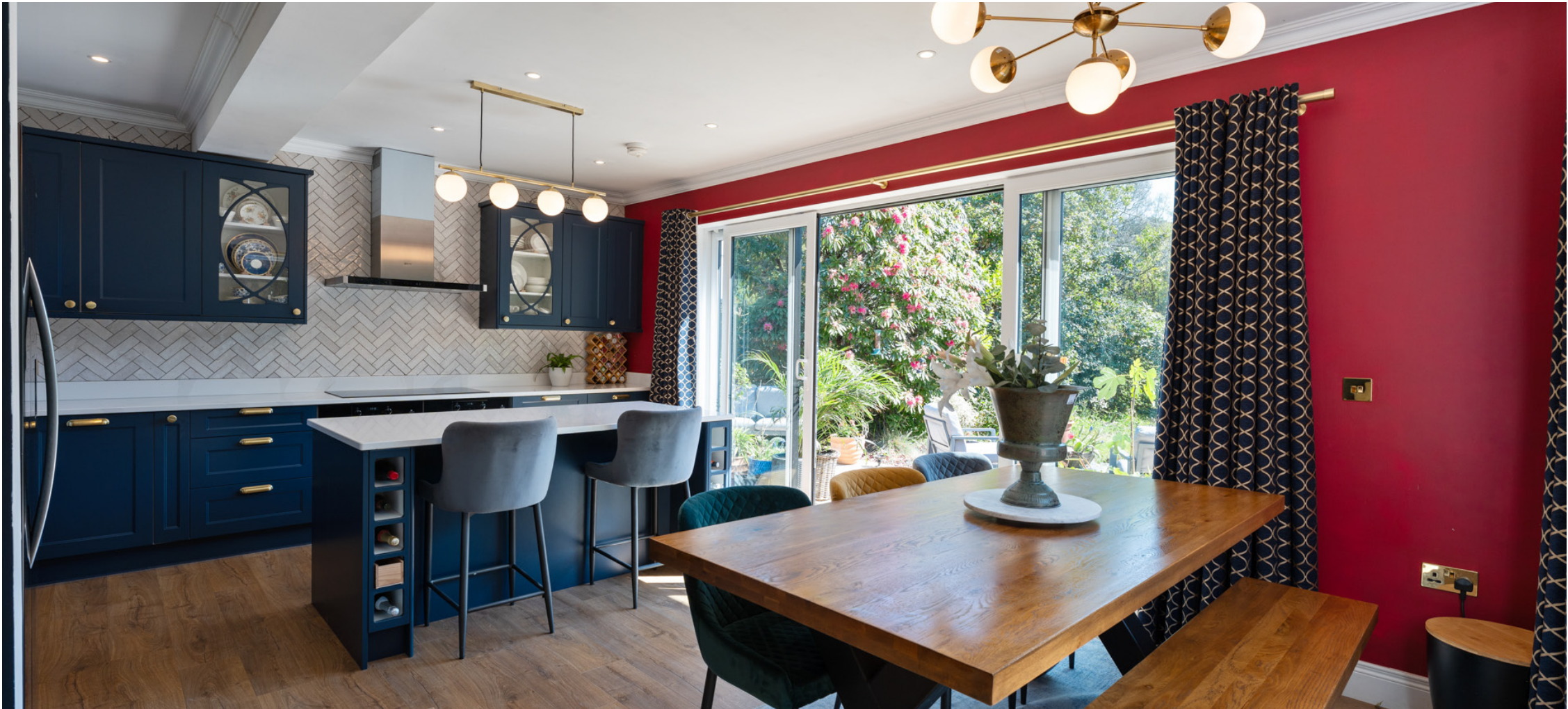
Open dining to shaker style kitchen