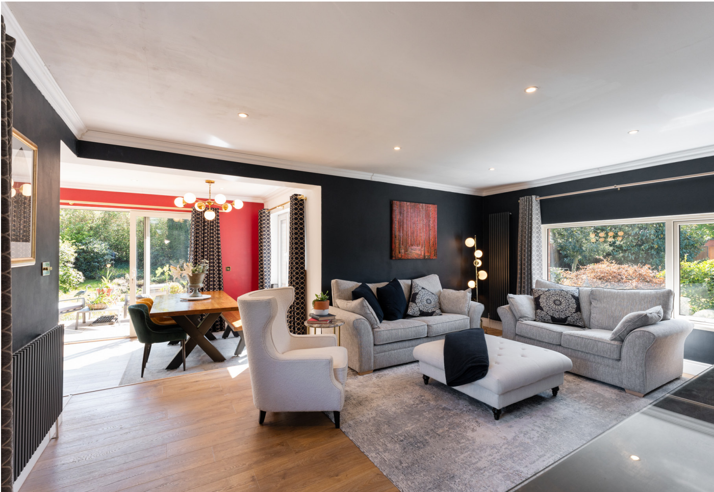
Open living dining area