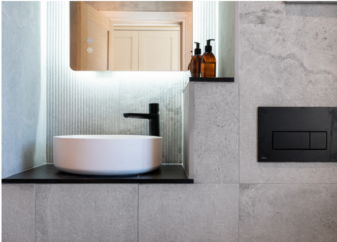
Circular sink with backlit mirror