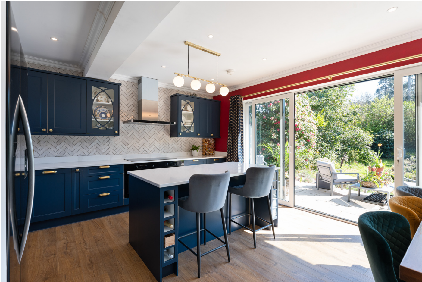
Kitchen open to patio and garden