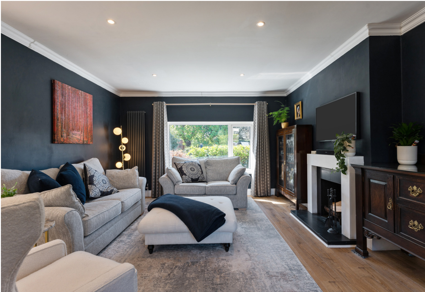
Cosy living room