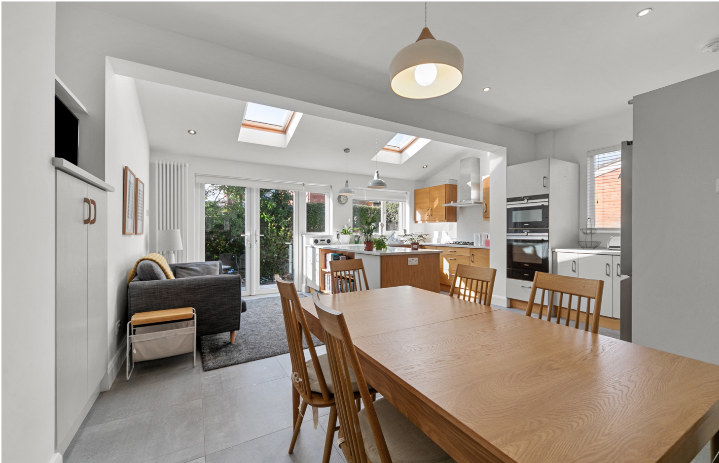
Space for dining table and chairs