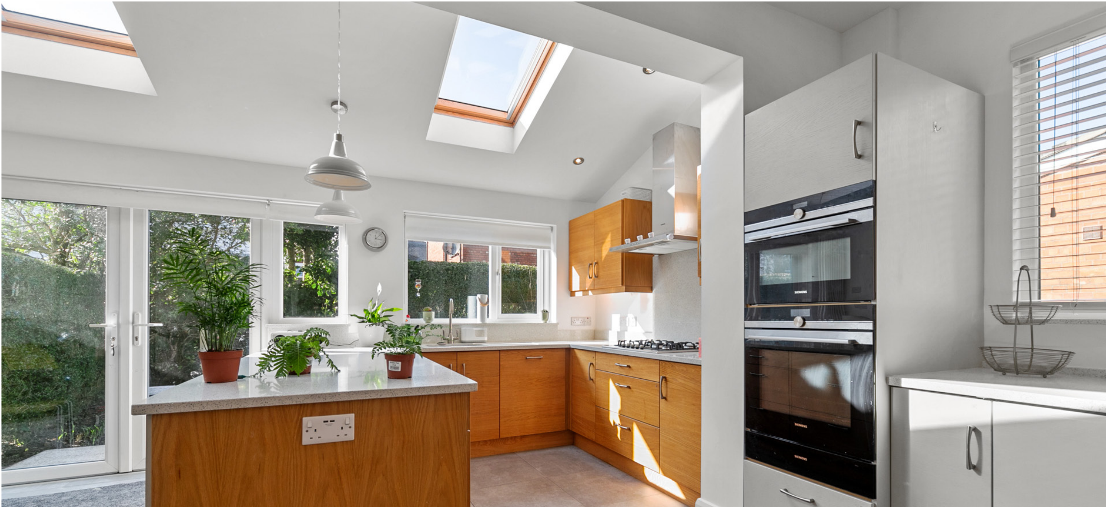
Stunning living / dining kitchen