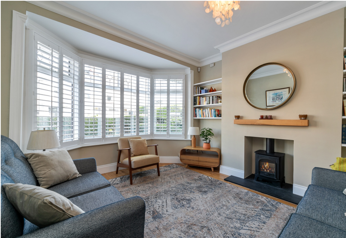
Comfortable living room with log burning stove