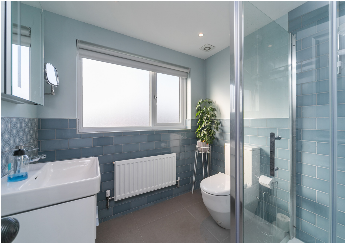
Attractive shower room