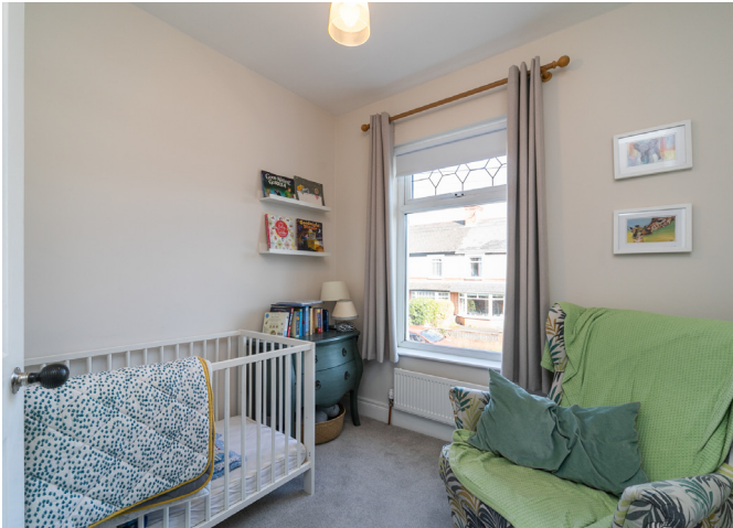
Bedroom (4) or Study