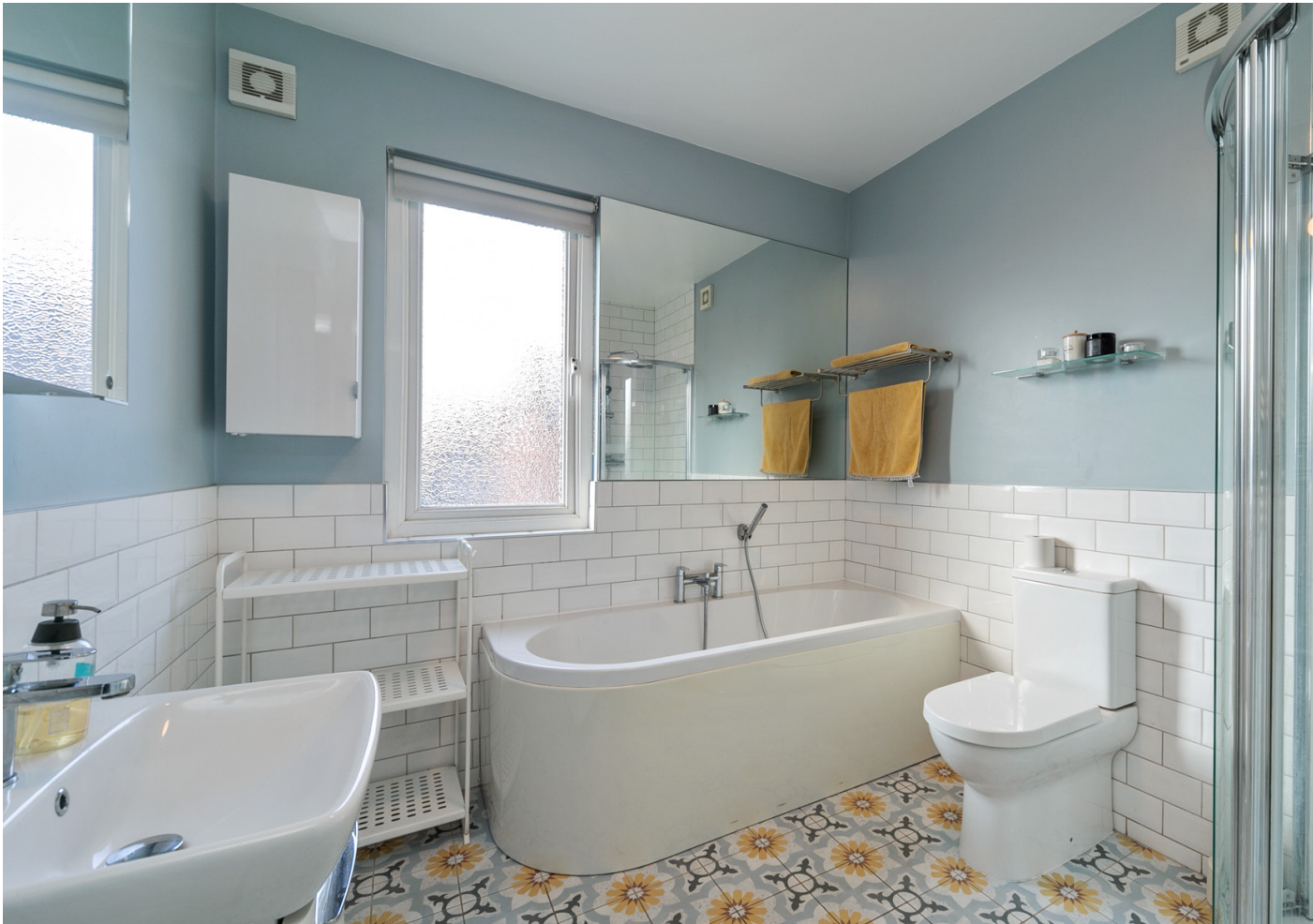
Lovely bathroom with bath and shower cubicle