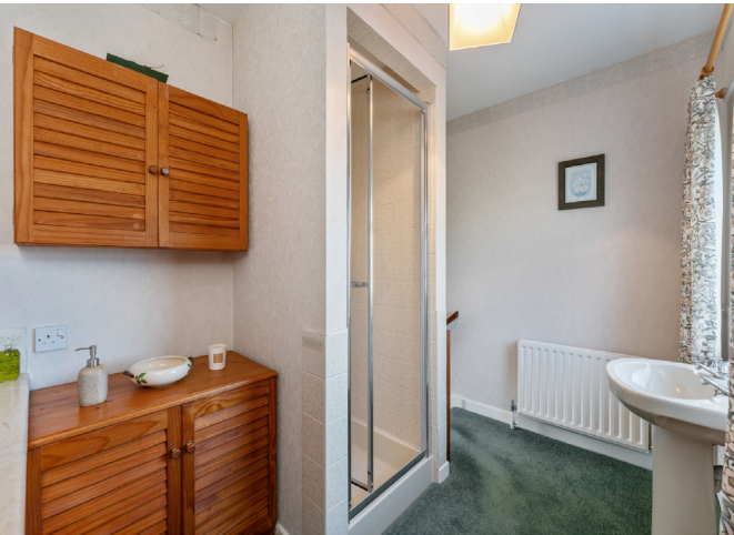
Ensuite shower room

South facing to rear with multi-level patio area. Hedge, wall and fence enclosed garden with shed and bin storage area. Gated pedestrian access to Crawfordsburn Village.