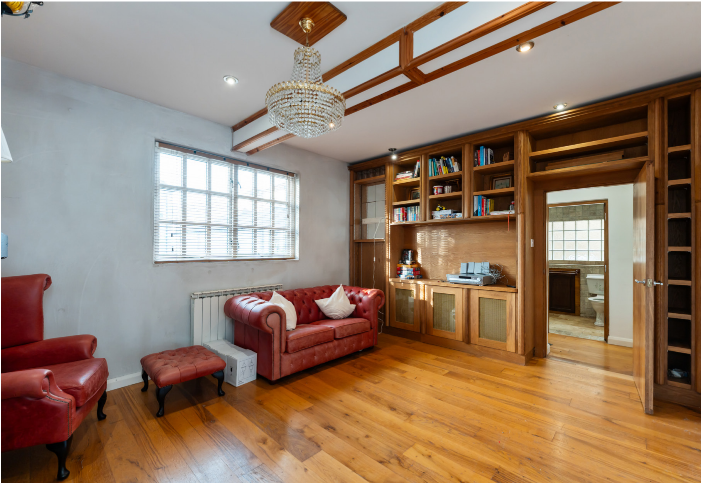
Living room of possible ground floor bedroom