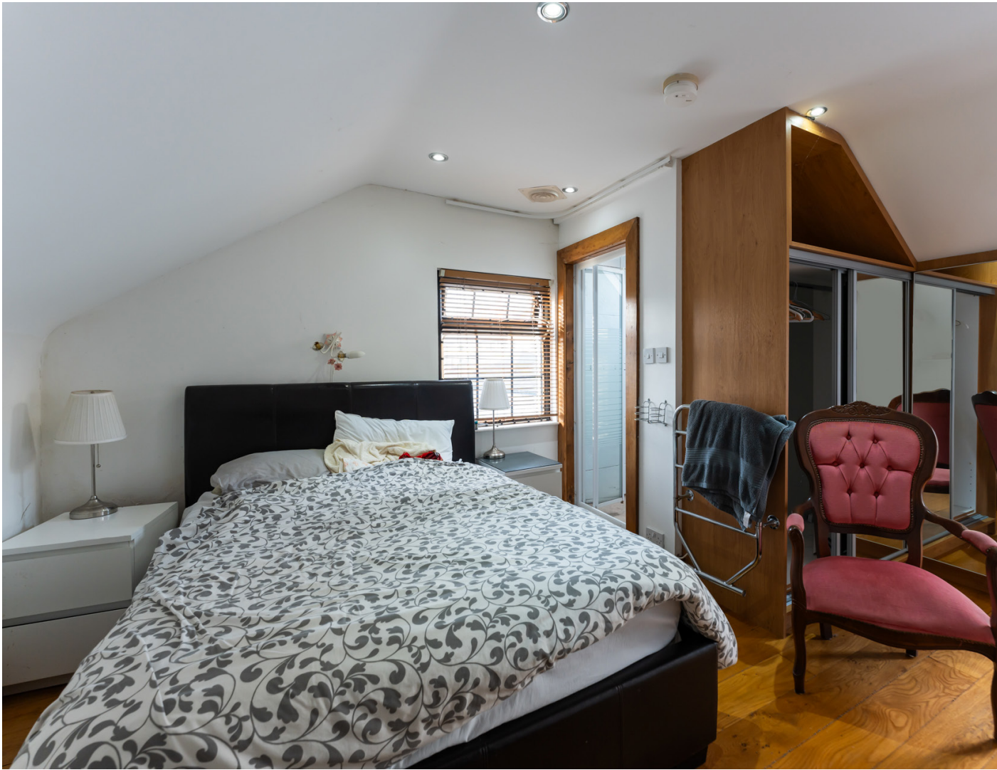
First floor bedroom with en suite and built in robes

STUDY OR ‘CHILL OUT’ AREA: Oak flooring, recessed lighting. Sitting area or study/home office. Access to roof terrace.