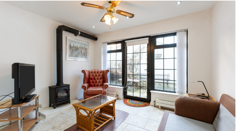
Sitting room out to courtyard