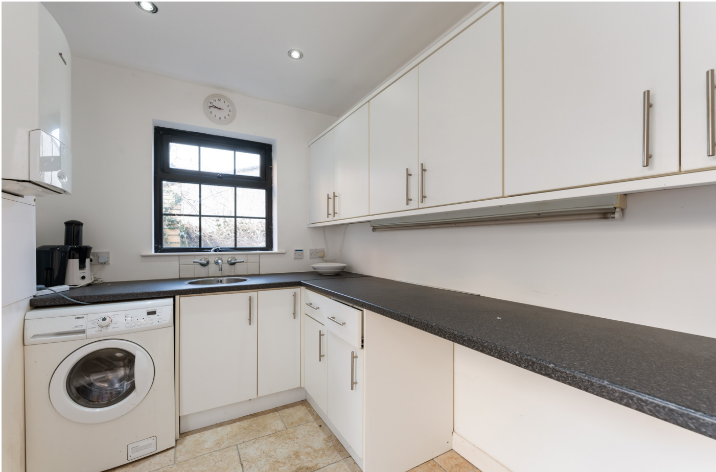
Separate utility room