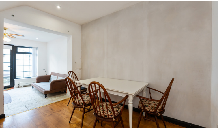
Dining open to Sitting room