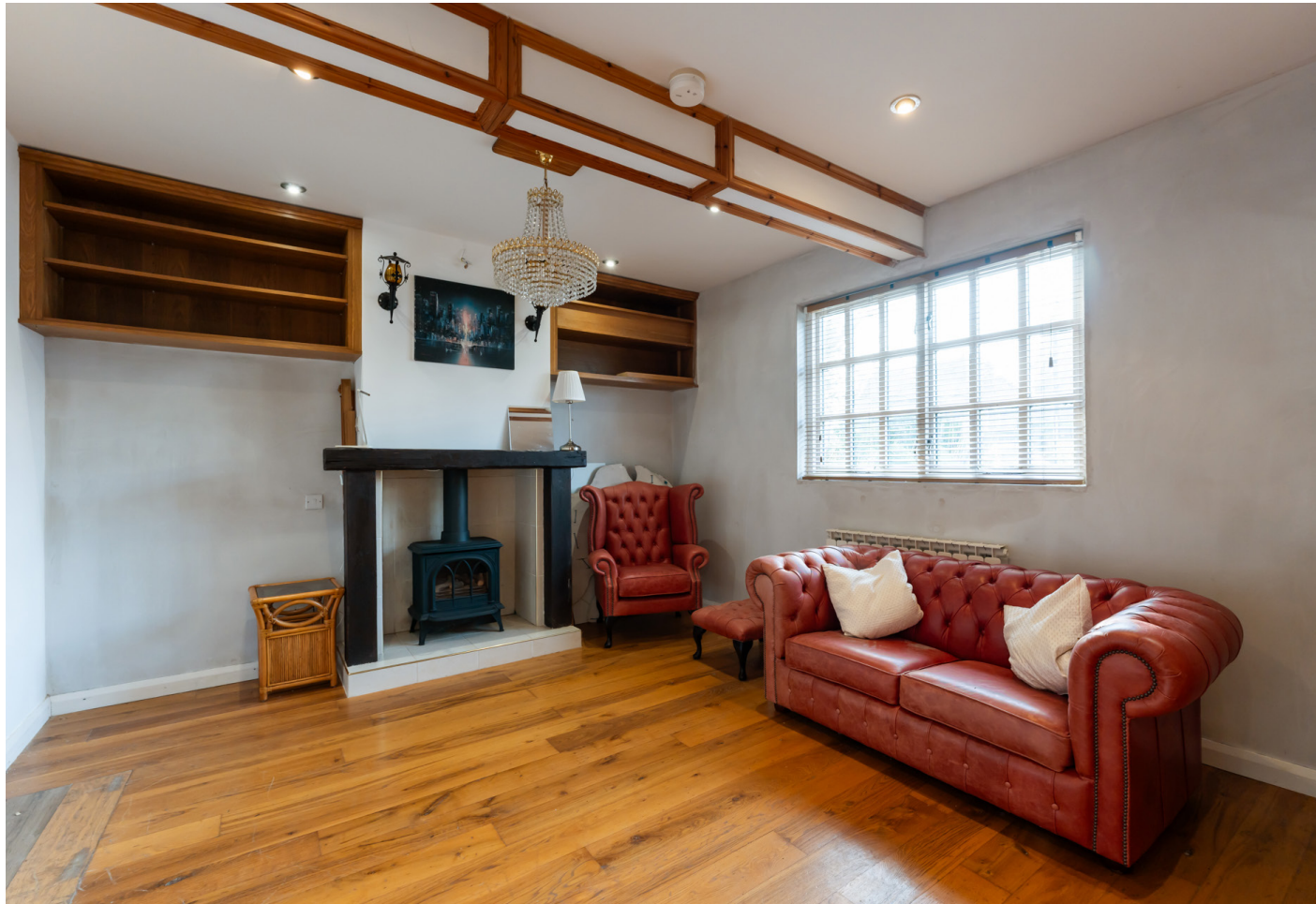
Living room or possible ground floor bedroom