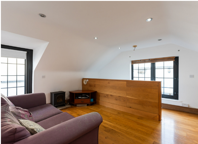
Study or ‘chill out’ area