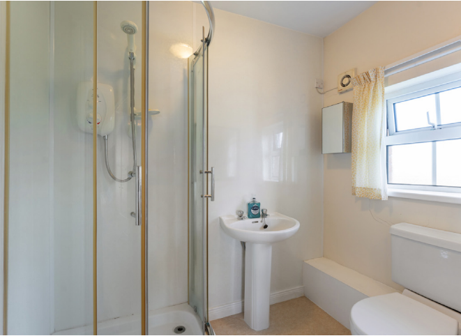
Ensuite shower room