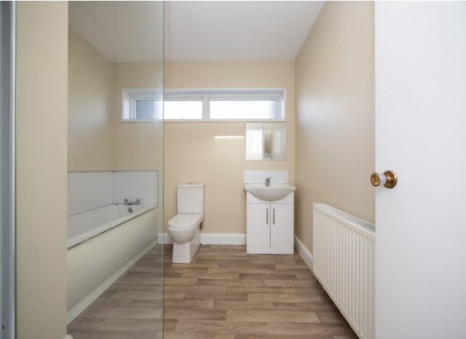
Bathroom with bath and shower