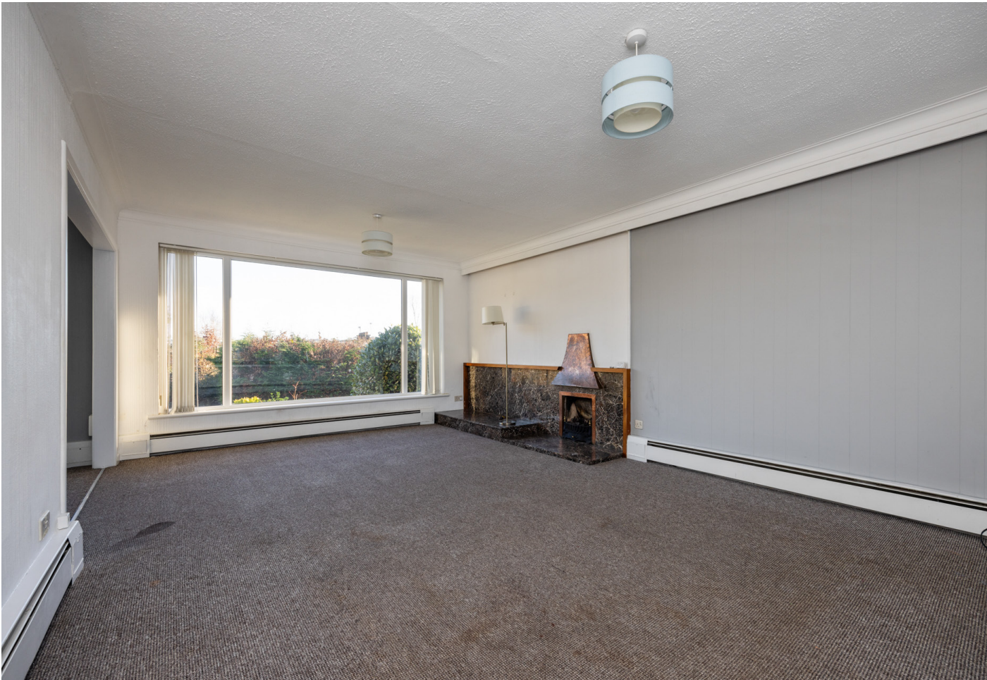
Bright Living room