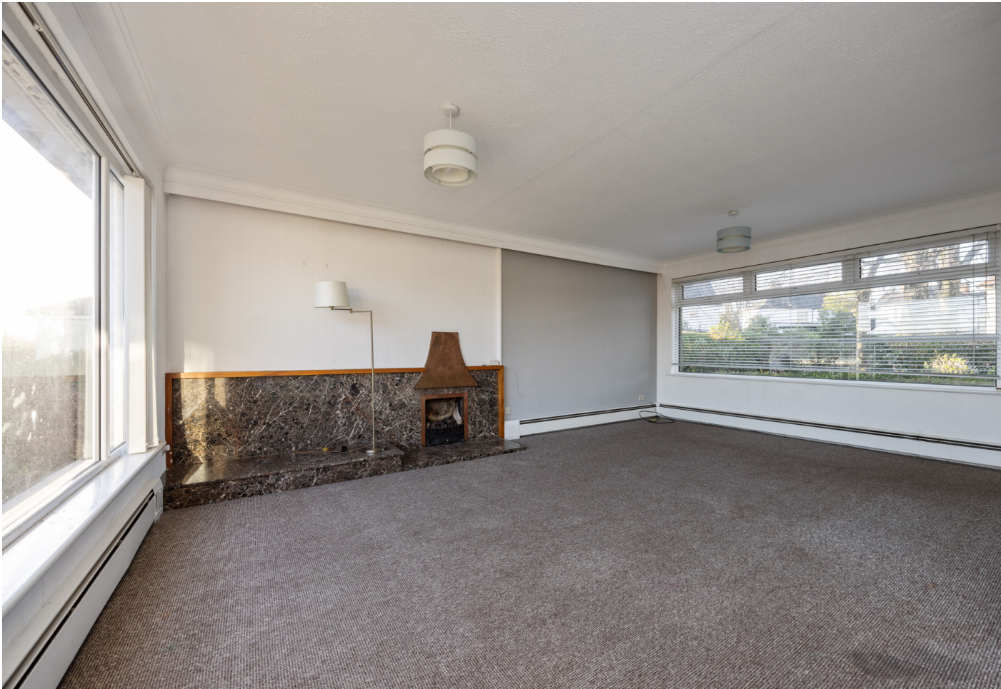
Living room with dual aspect