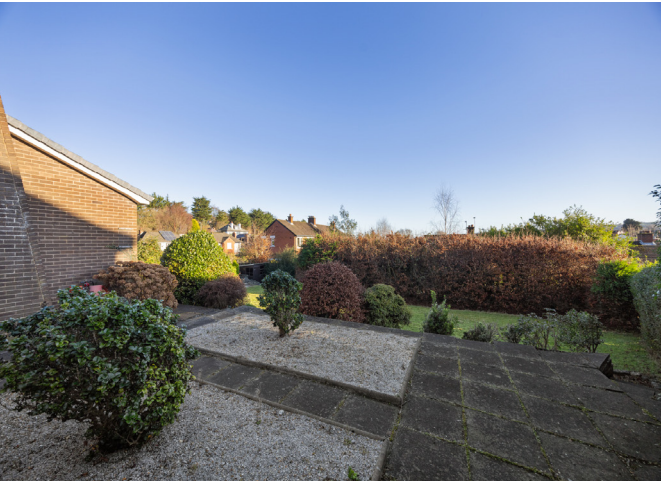
Flagged patio area