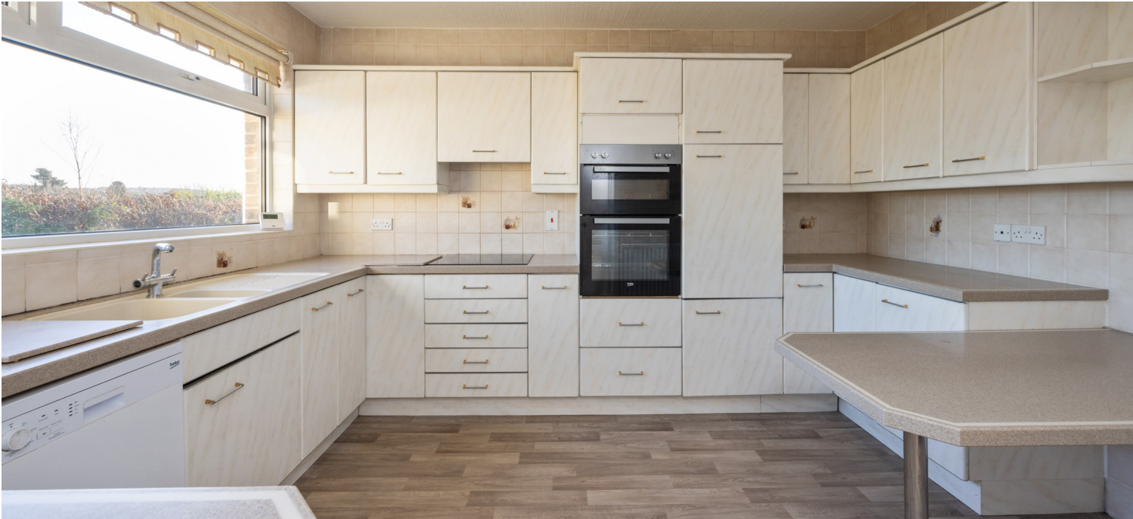
Kitchen overlooking rear garden