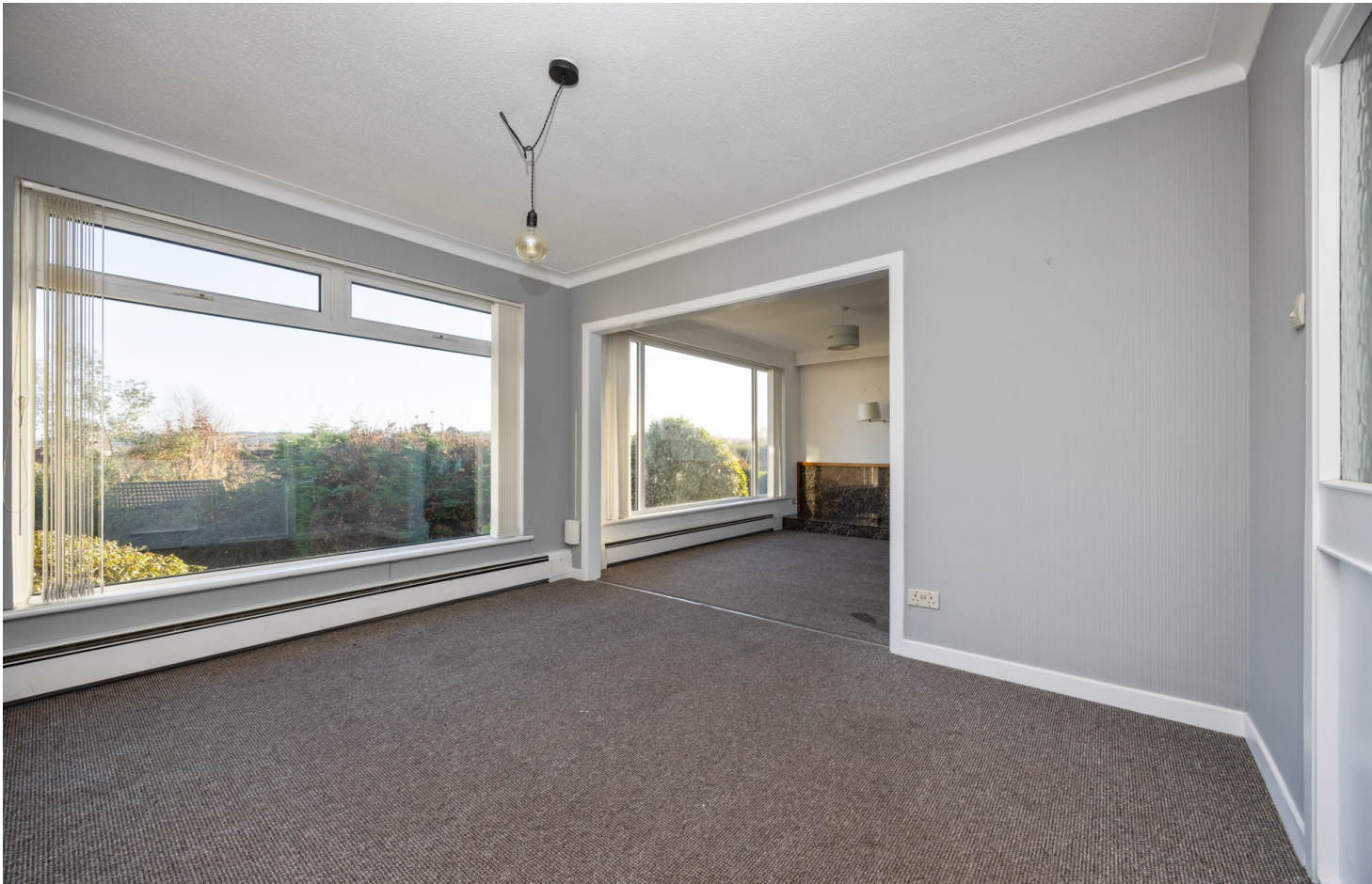
Dining room which could be separated with doors if required