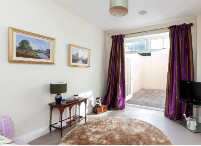
Living room/bedroom three