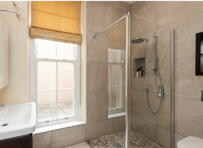
Luxury ensuite shower room

The apartment also comes with two private parking spaces.