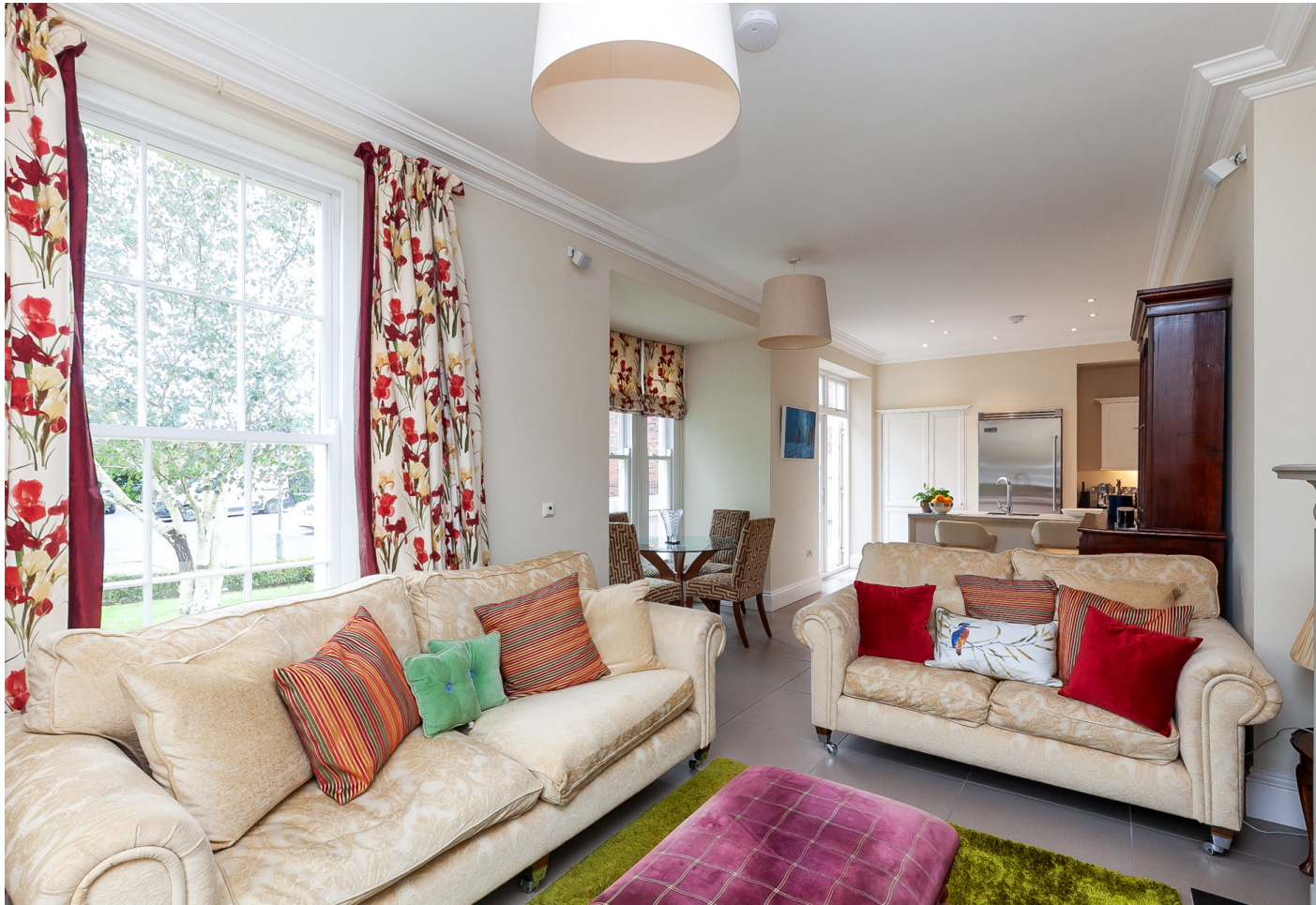
Drawing room open to luxury kitchen