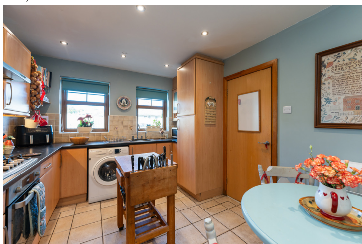
Kitchen with dining area