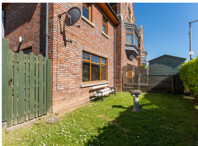
South facing garden