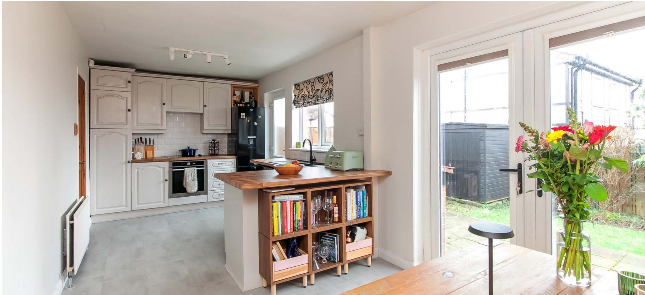
Kitchen opening to living and dining