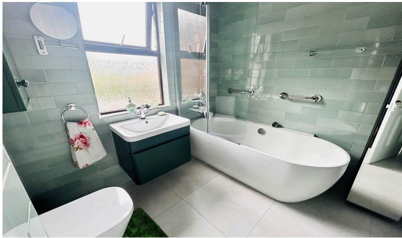
BATHROOM 1: 2.18m (7'2) x 2.22m (7'3)

Low flush WC, wall mounted hand basin, tiled floors and tiled walls.