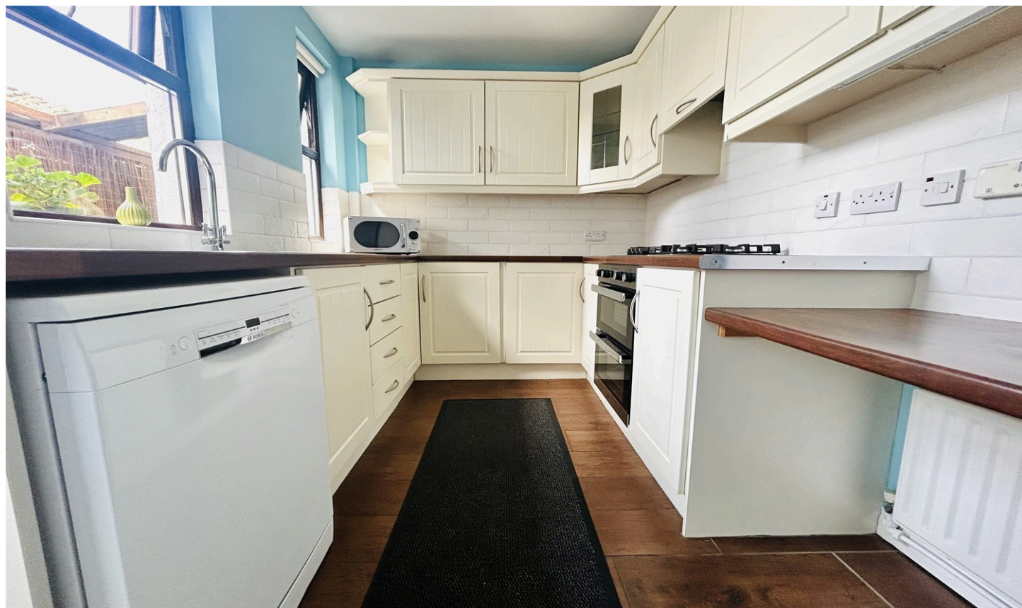
KITCHEN : 3.72m (12'2) x 2.17m (7'1)

Wood effect laminate flooring, uPVC double glazed, built in storage.