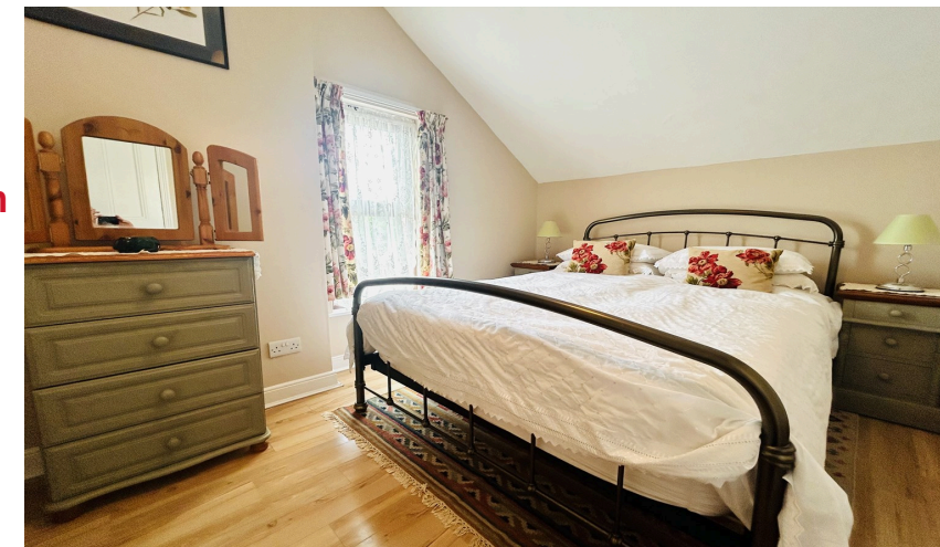
BEDROOM 4: 4.4m (14'5) x 3.54m (11'7)

Wood effect laminate flooring, uPVC Double glazed