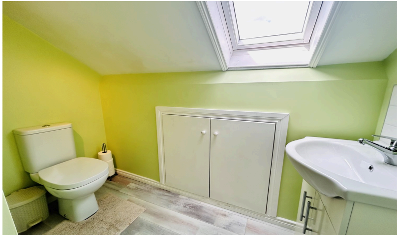
BATHROOM 2: 2.24m (7'4) x 1.06m (3'6)

Low flush WC, wall mounted hand basin, tiled floors and tiled walls.