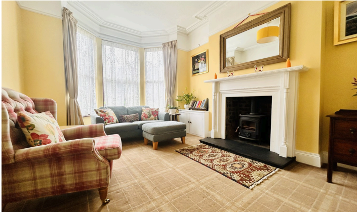
RECEPTION 1: 4.47m (14'8) x 3.16m (10'4)

Externally the property has a low maintenance front garden and colourful rear courtyard that would be suitable for social gatherings with friends or family.