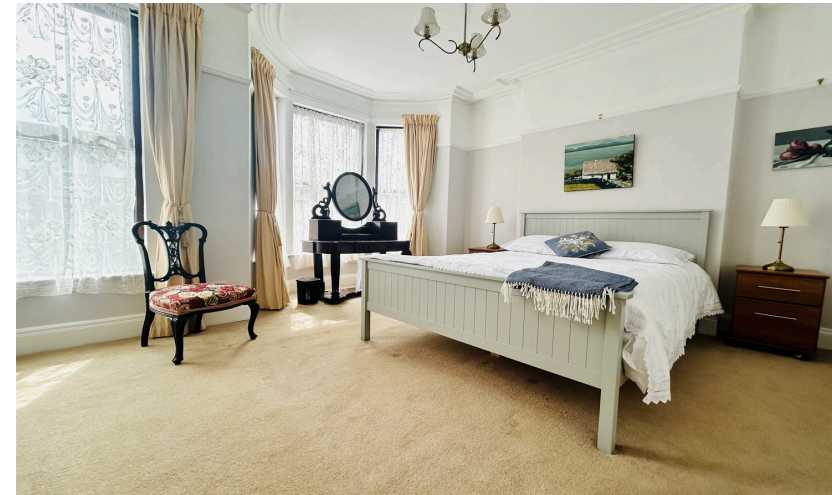
BEDROOM 1: 2.18m (7'2) x 2.22m (7'3)

range of high and low level units, formica worktops, stainless steel sink, partially tiled walls