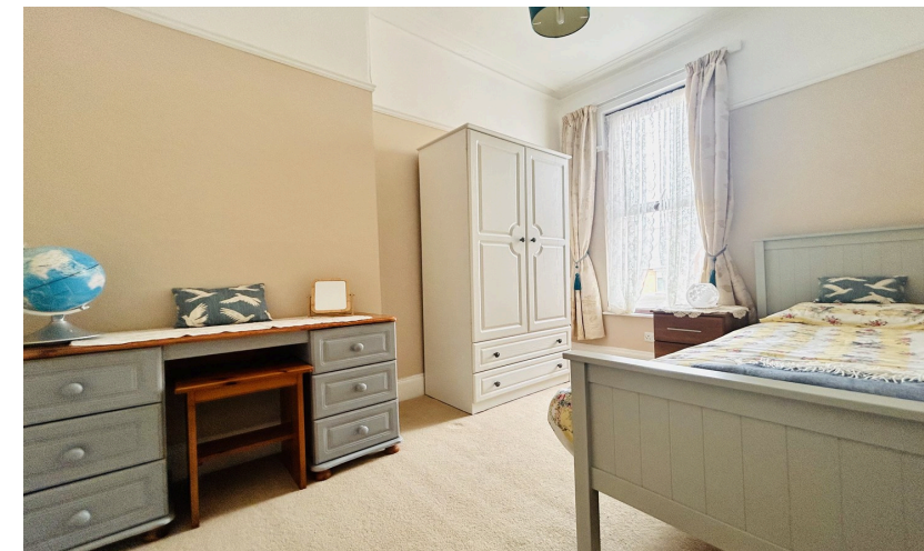
BEDROOM 2: 4.44m (14'7) x 4.43m (14'6)