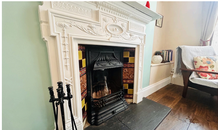
RECEPTION 2: 3.35m (11') x 3.31m (10'10)

uPVC Double glazed, carpet, cast iron wood burner