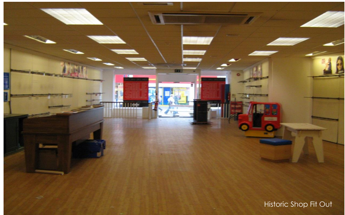
Historic Shop Fit Out