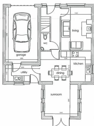
proposed ground floor plan