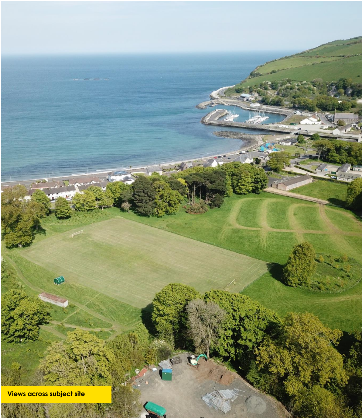
Views across subject site