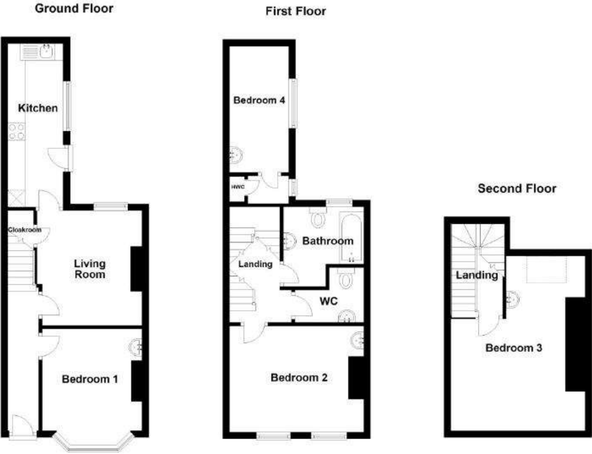
Total area: approx. 89.1 sq. metres (958.8 sq. feet) This plan is for illustrative purposes only. Plan produced using PlanUp. 167 Dunluce Avenue, Belfast

Outside Enclosed rear yard with boiler house & oil tank