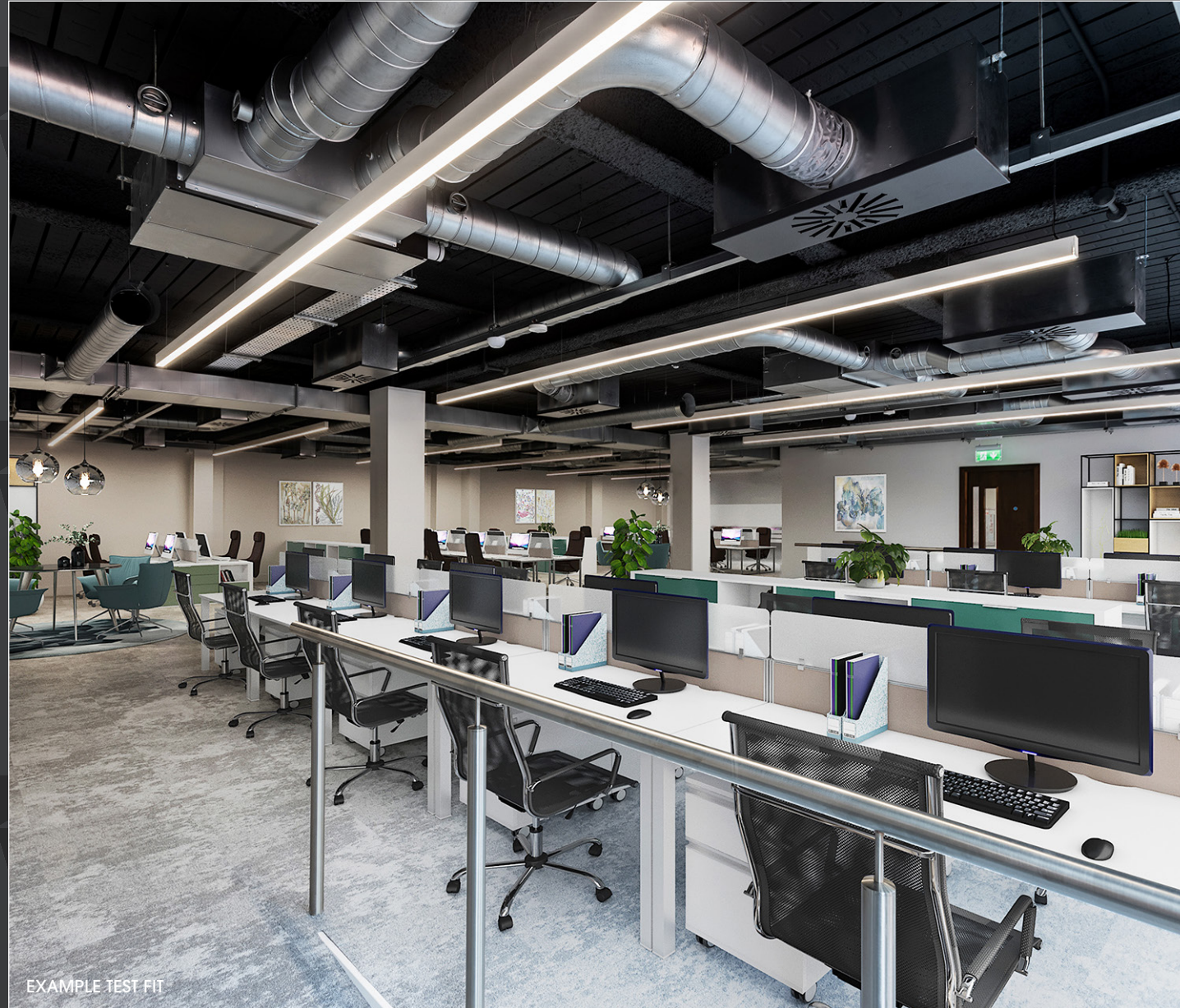
EXAMPLE TEST FIT