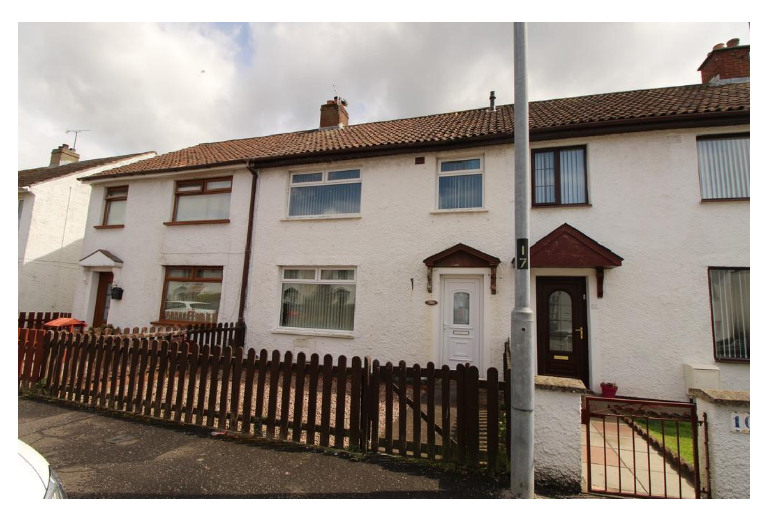
Energy Efficiency Rating C.

An excellent opportunity to purchase this bright, spacious mid terrace home located in a highly popular and convenient location. The property will appeal to both First Time Buyers and investors alike and we strongly recommend early viewing as homes in this location rarely remain on the market for long.