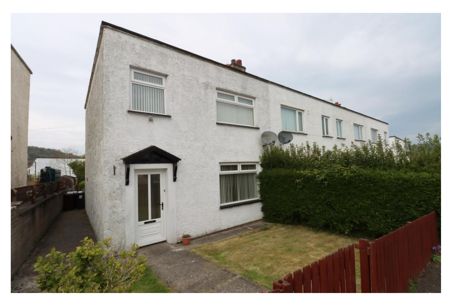
Energy Efficiency Rating F.

The End Townhouse will appeal to both first time buyers and investors wishing to purchase a home that requires modernisation at an affordable level. Demand will be high and therefore recommend viewing at your earliest convenience.